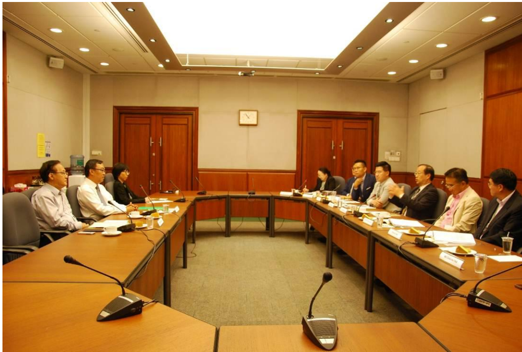
The delegation exchanges views with the Chairman and Deputy Chairman of the Government Parliamentary Committee for Transport on transport policy.