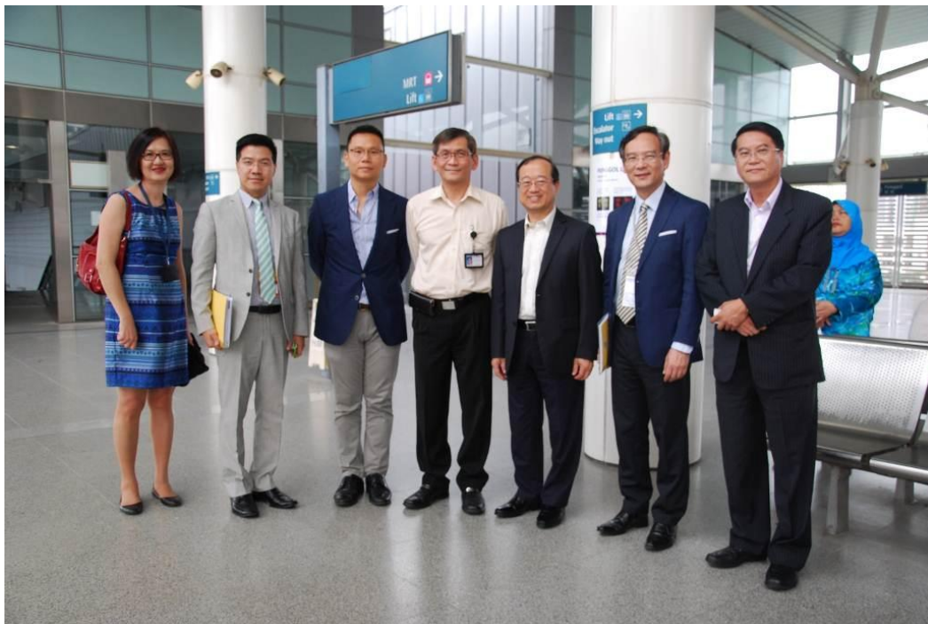
The delegation visits the Sengkang Integrated Transport Hub.