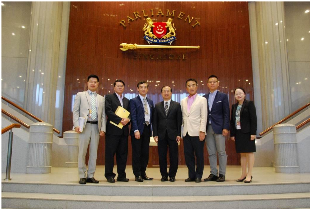
Delegation members take a group photo at the Parliament of Singapore.