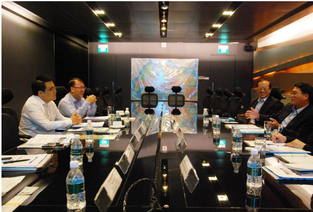
Members of the delegation receive a briefing from the representatives of the Land Transport Authority on the experience of Singapore in the implementation of traffic control measures.