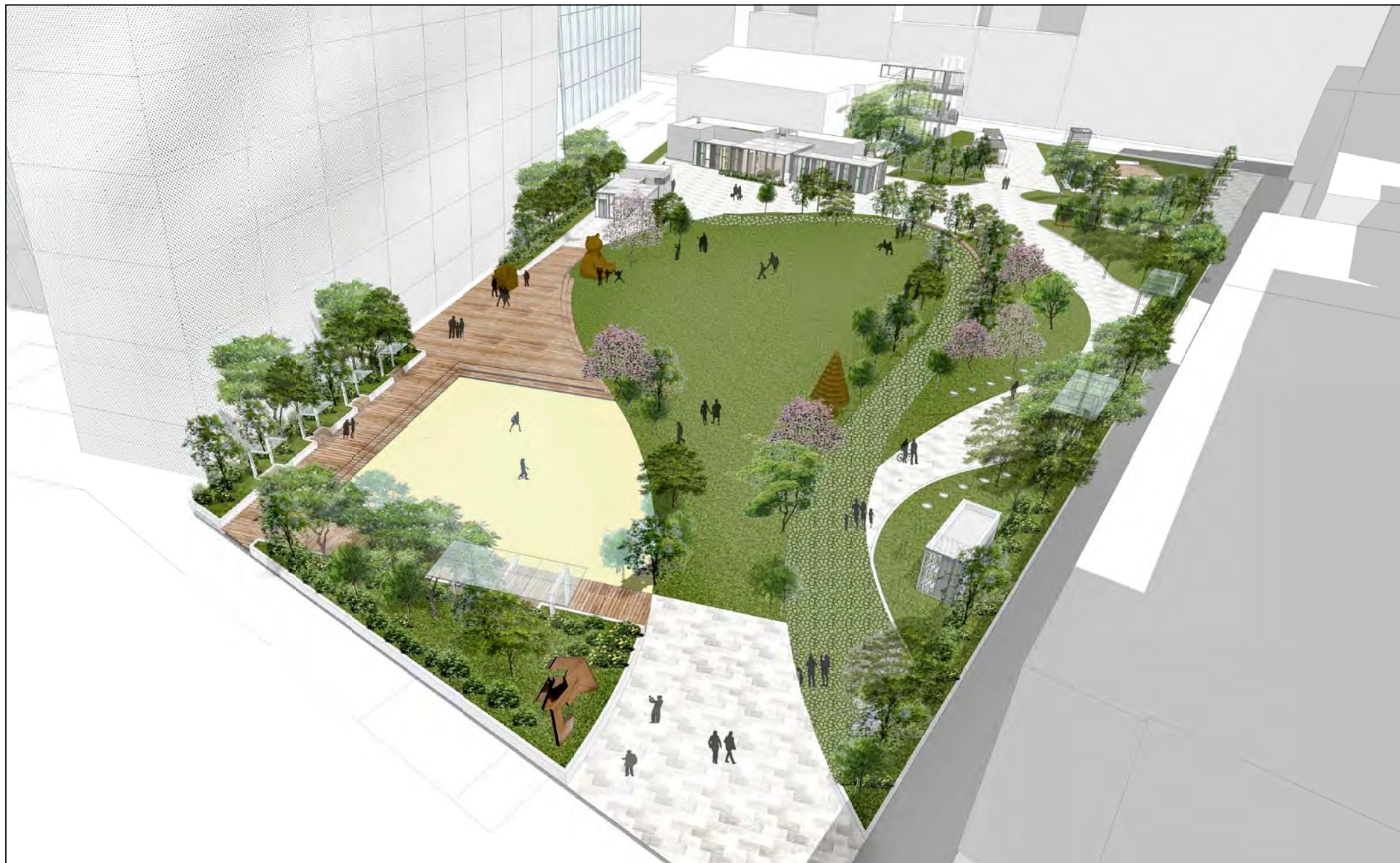
從西北面俯瞰公園的構思圖 AERIAL VIEW FROM NORTHWESTERN DIRECTION (ARTIST'S IMPRESSION)

PROJECT TITLE 項目名稱 450RO 改建駿業街遊樂場為觀塘工業文化公園 CONVERTING TSUN YIP STREET PLAYGROUND AS KWUN TONG INDUSTRIAL CULTURE PARK