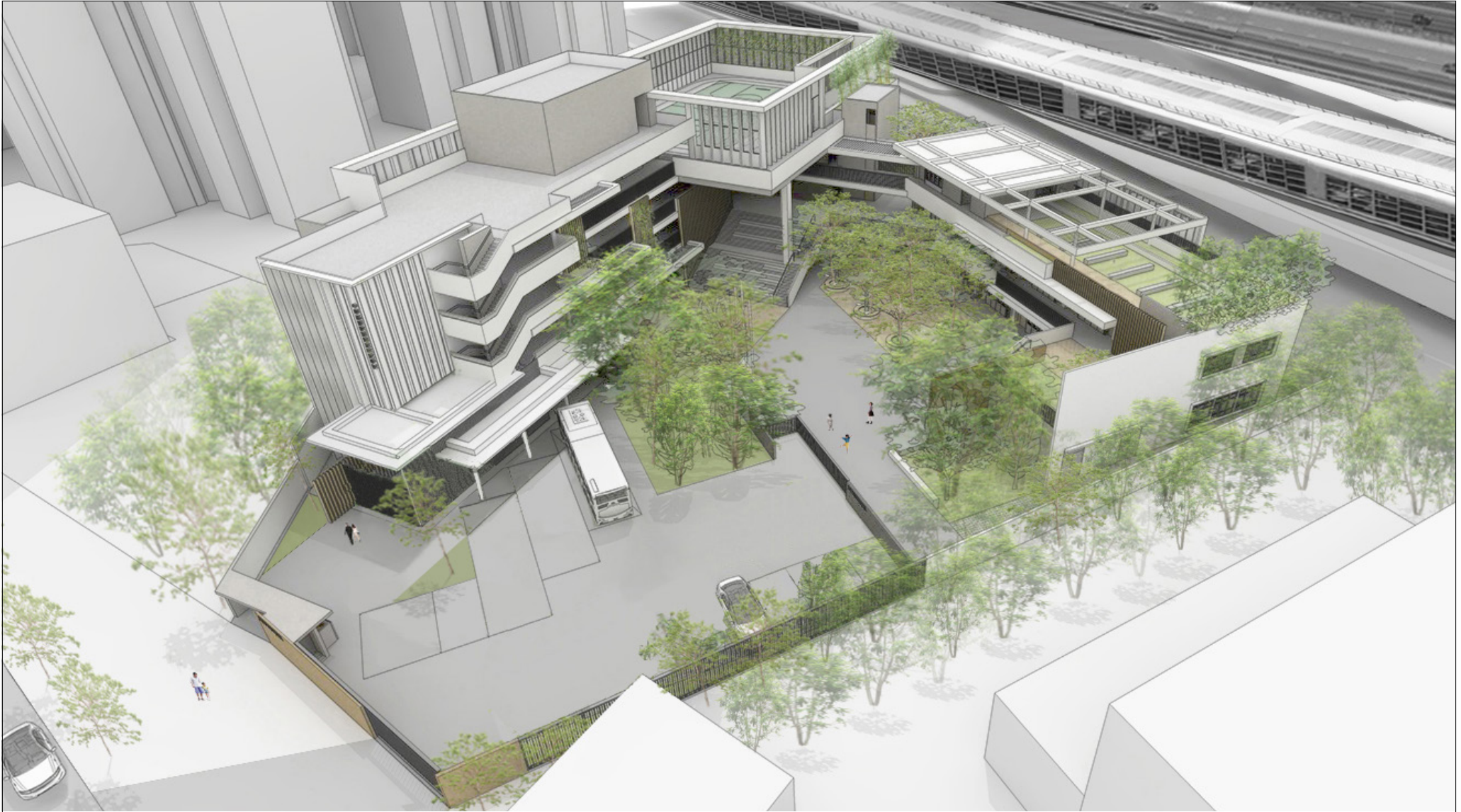
從東北面望向學校的構思鳥瞰圖 AERIAL VIEW FROM NORTH EASTERN DIRECTION (ARTIST'S IMPRESSION)