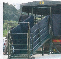
The original unsuitable Cattle Transport Vehicle

Since November 2009, we have been working with Friends of Sai Kung (FSK), the Agricultural and Fisheries Department (AFCD) and the SPCA to resolve any conflicts involving people and cattle and come up with a better management plan for our feral cattle.