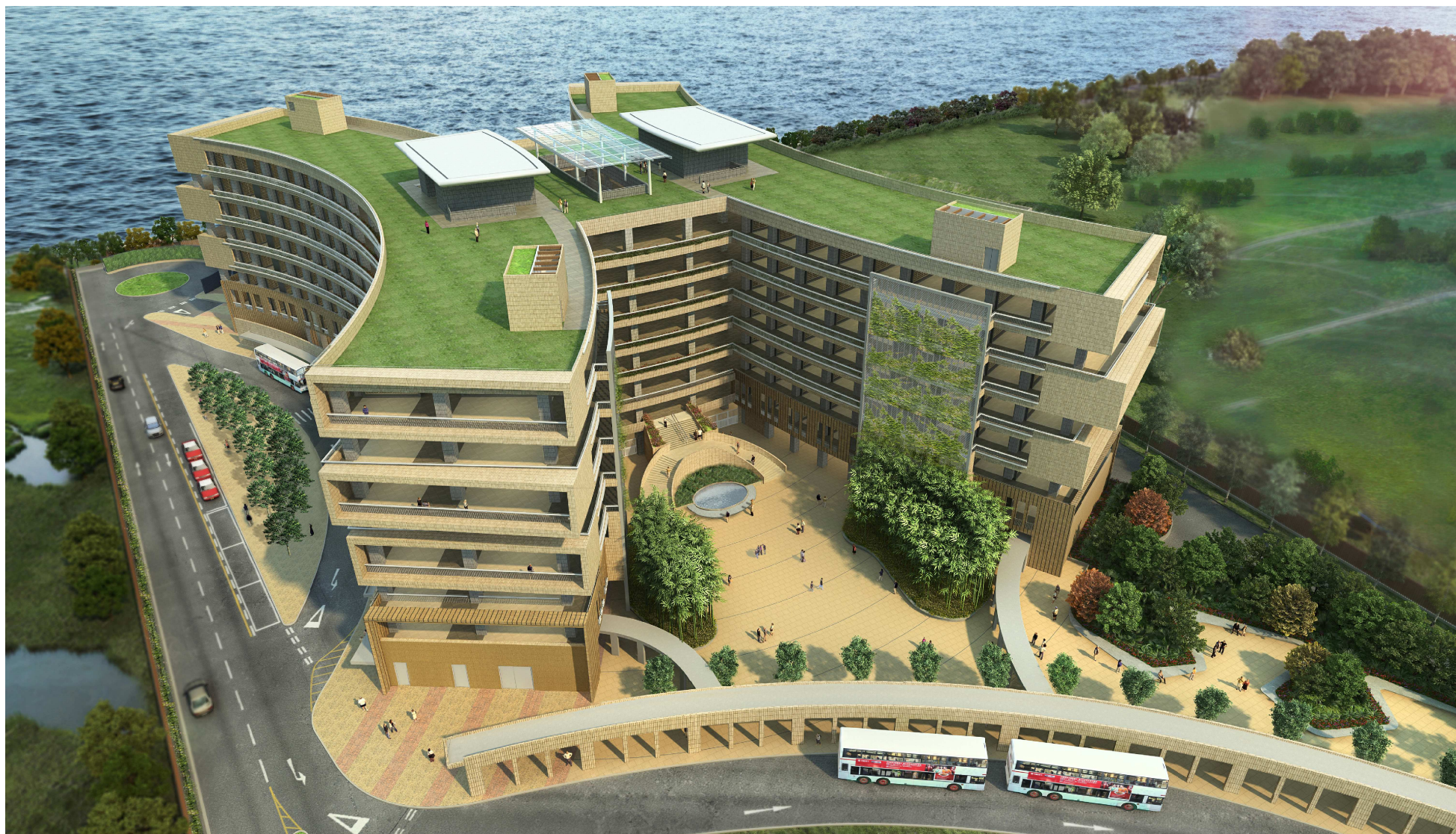
從南面望向大樓的構思圖 PERSPECTIVE VIEW FROM SOUTHERN DIRECTION (ARTIST'S IMPRESSION)