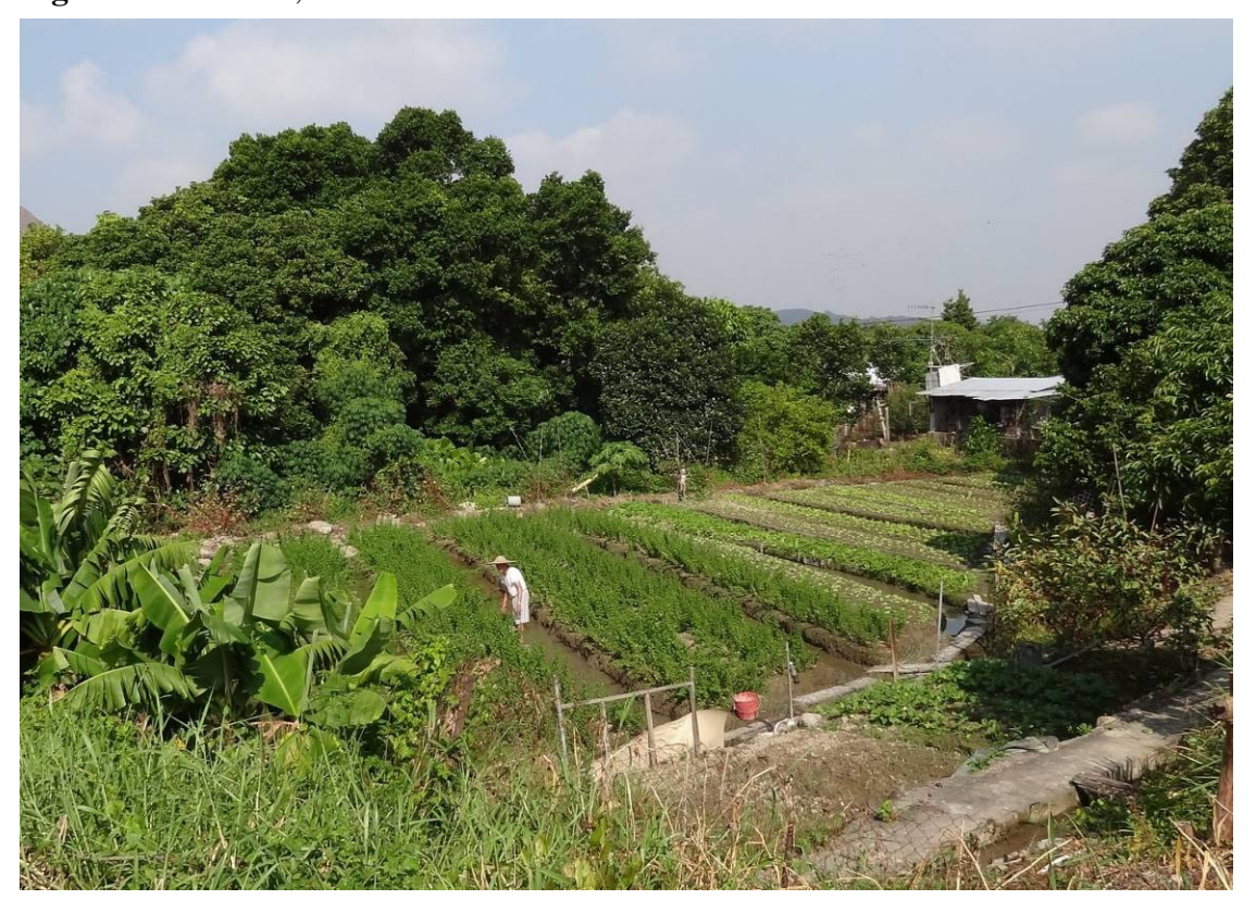
Figure 2. Traditional farming in the New Territories