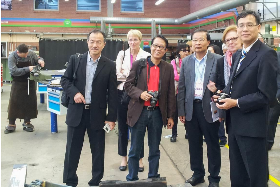
Members of the Legislative Council Panel on Education tour around the Industriepark Höchst, an industrial park in Frankfurt.