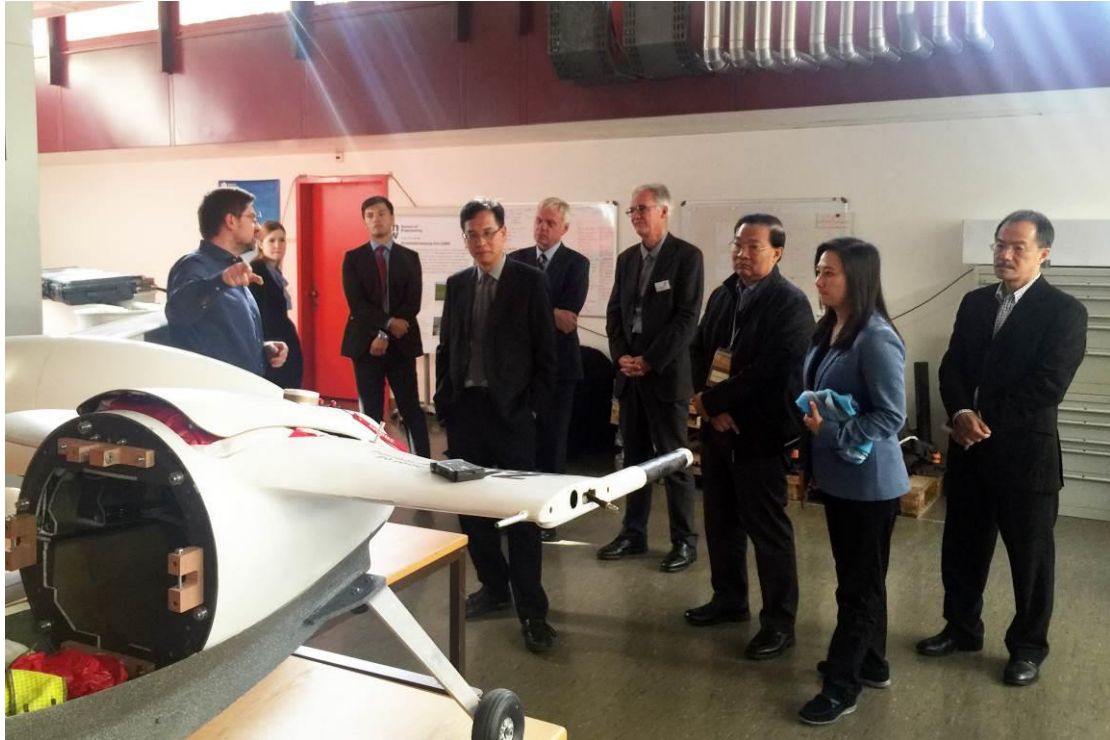
The delegation of the Legislative Council Panel on Education tours the campus of the Zurich University of Applied Sciences.