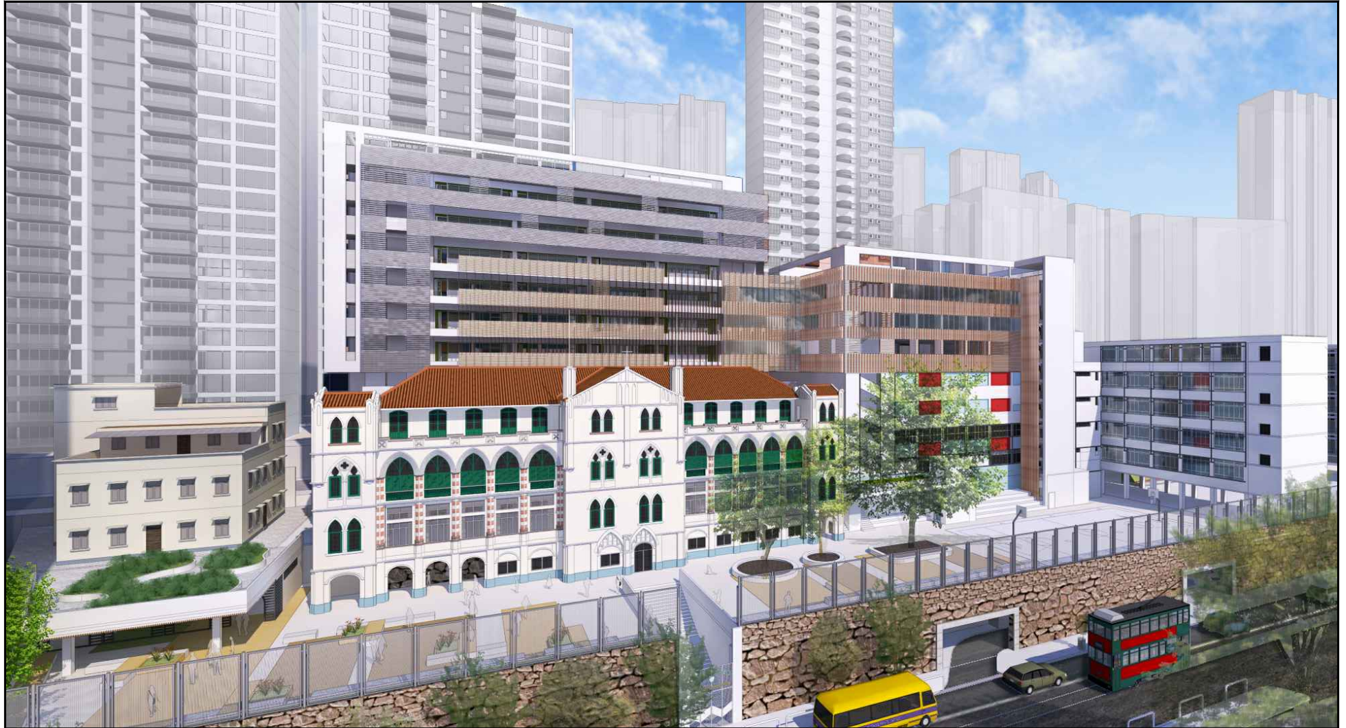
VIEW OF THE NEW ANNEX FROM WONG NAI CHUNG ROAD (ARTIST IMPRESSION)