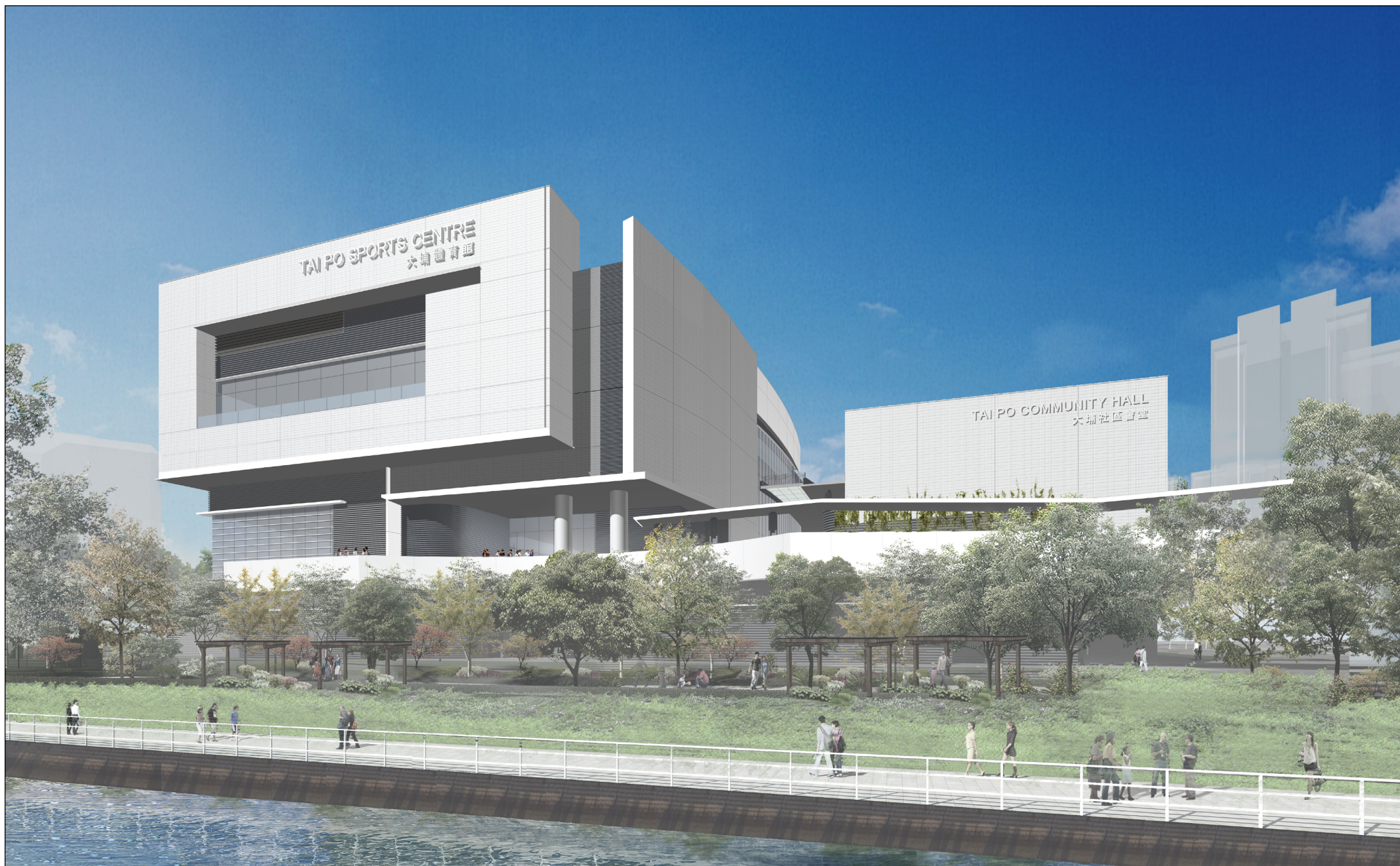
從北面望向大樓的構思透視圖 PERSPECTIVE VIEW FROM NORTHERN DIRECTION (ARTIST'S IMPRESSION)