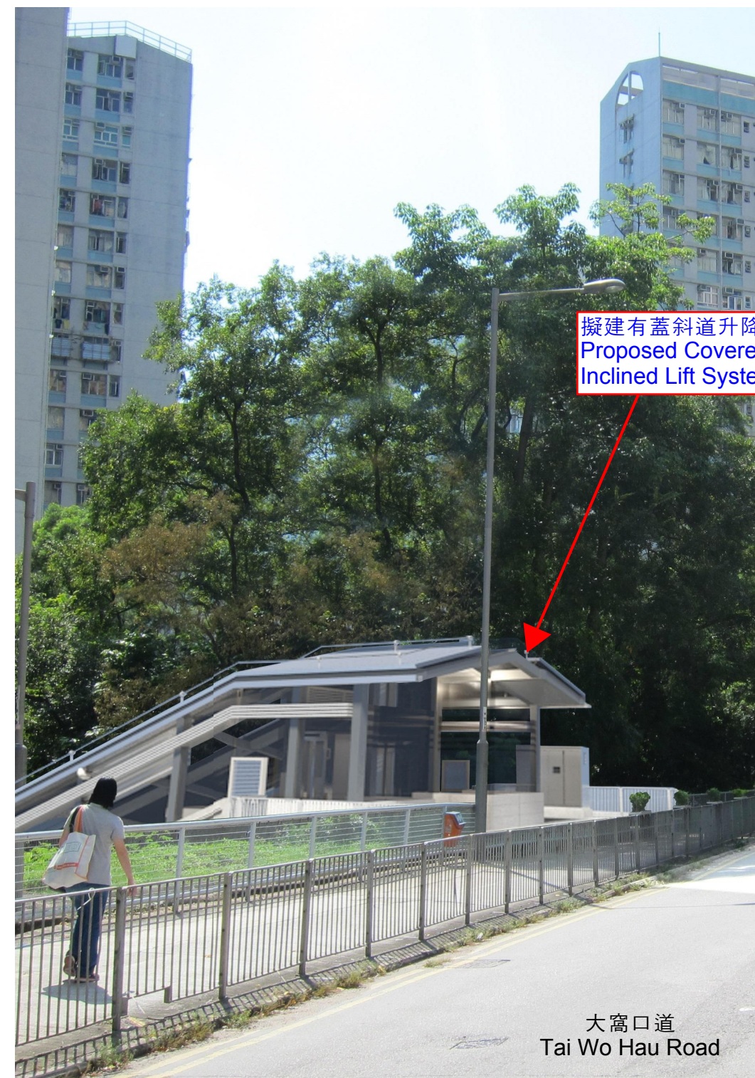
圖示 "B" VIEW "B"