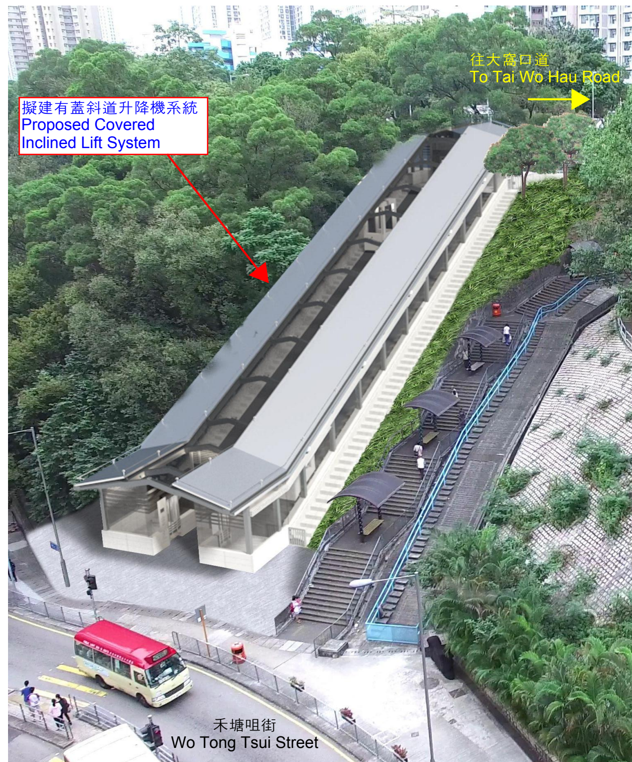
圖示 "A" VIEW "A"