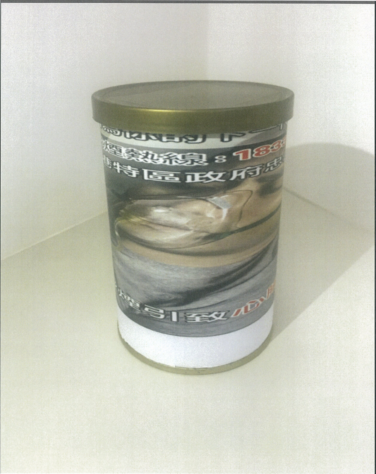
C罐仔立體圖.jpg (1.4 MB)