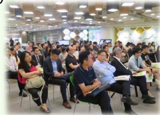
Briefing sessions organised by the Secretariat