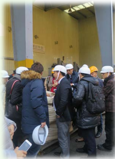
A study mission to understand overseas recycling facilities