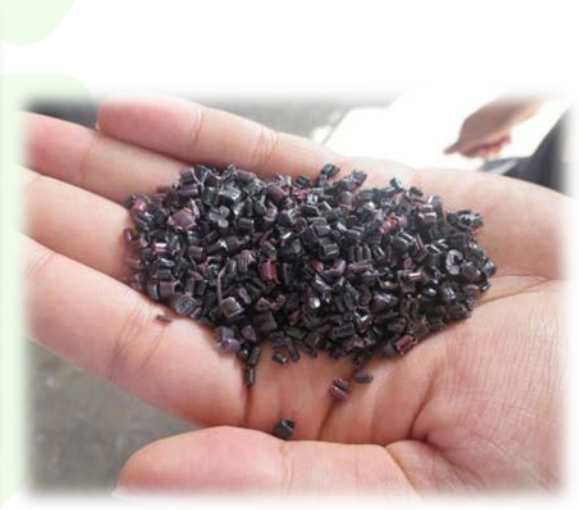
Raw plastic materials