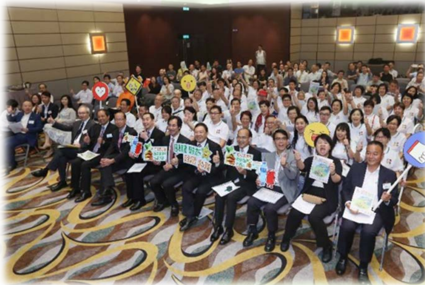
Kick off ceremony cum seminar for the recycling industry organized by a grantee