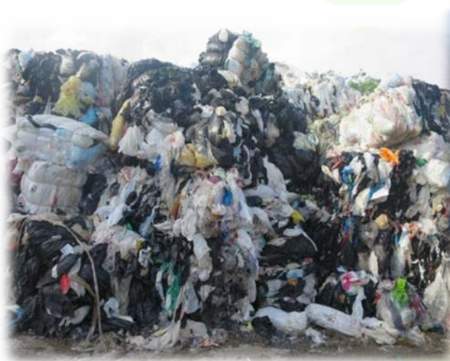
Collection of waste plastic bags