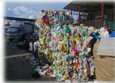
On-site inspection of project implementation