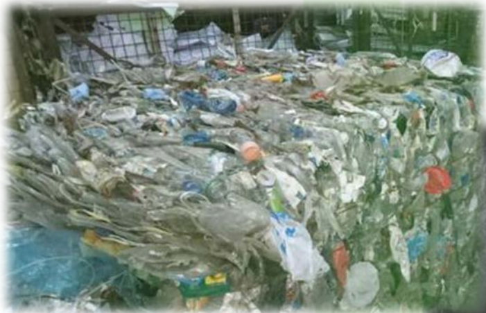
Waste plastic bottles collected by small scale recyclers