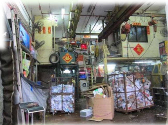
Operation site of a small scale recycler