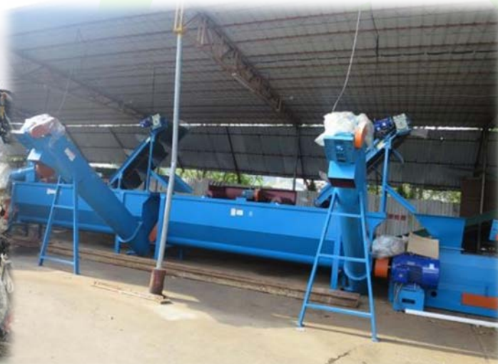
Installation of plastic treatment equipment