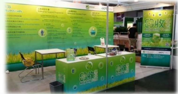
Booth set up at Eco Expo