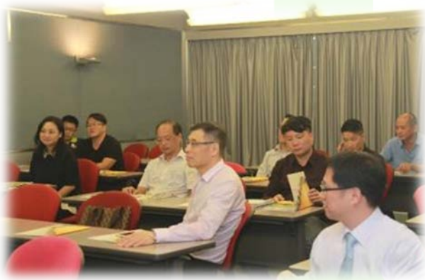
A recycling industry seminar organised by a grantee