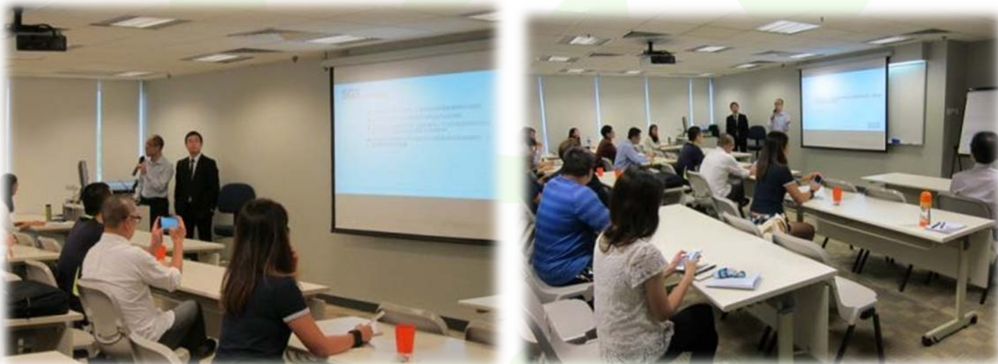
A briefing session introducing the quantity requirements for recyclers, auditors and approved certification bodies