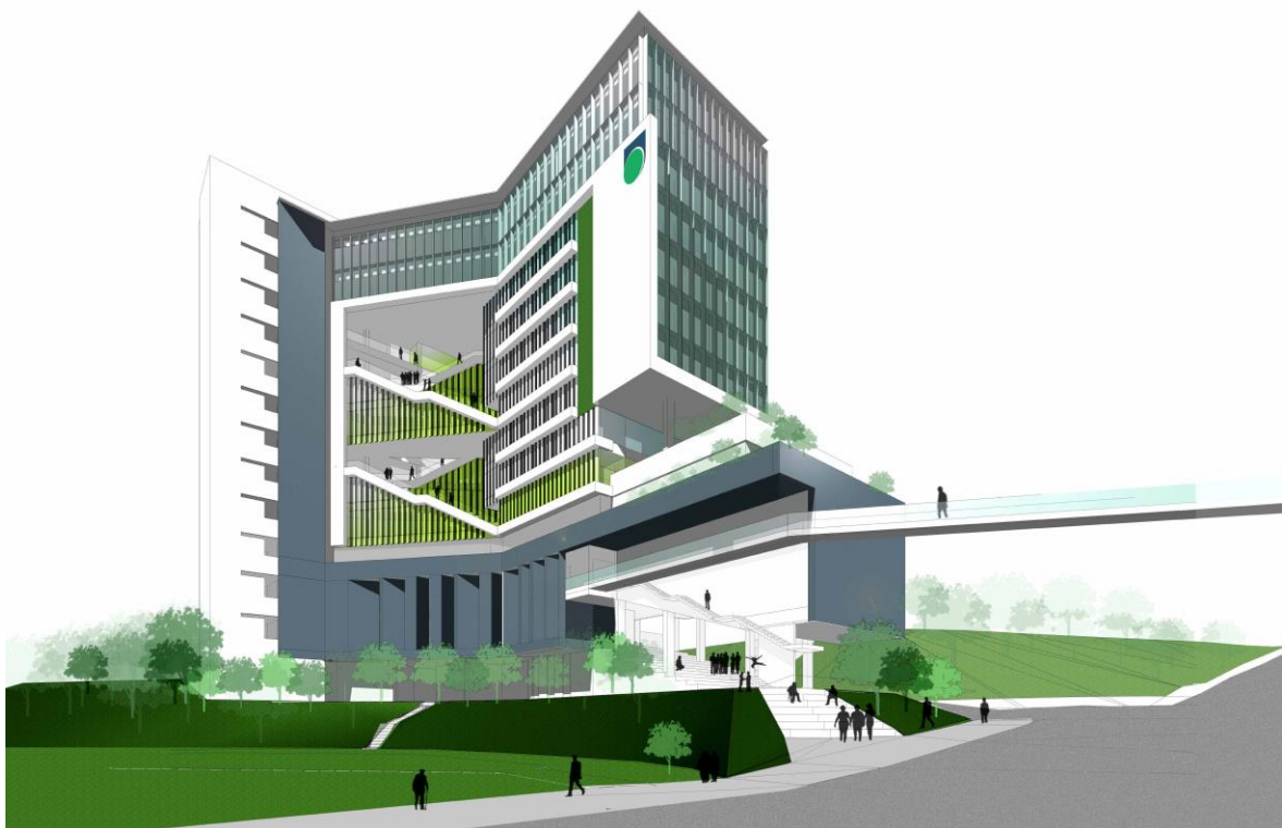
View from Fat Kwong Street