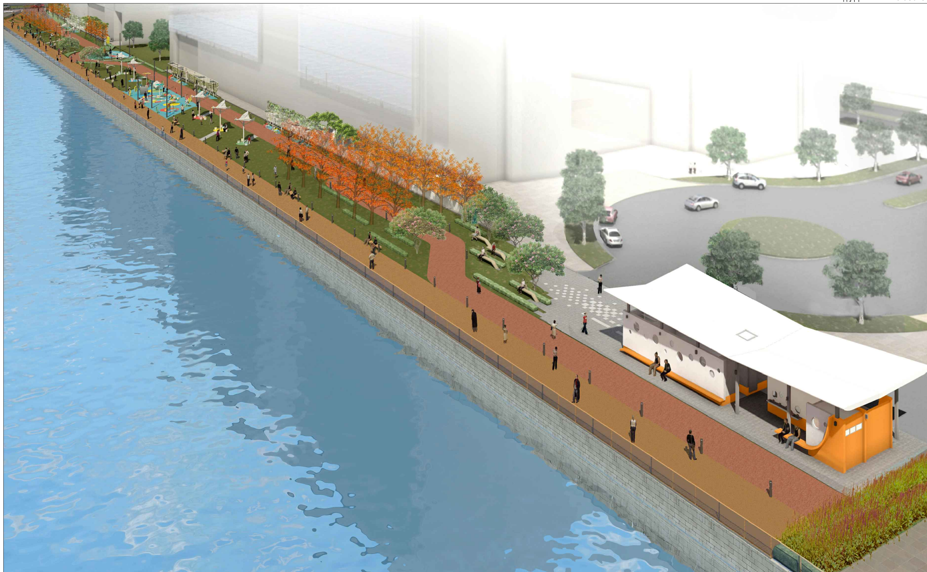
從東南面望向海濱的構思圖 PERSPECTIVE VIEW FROM SOUTH EASTERN DIRECTION (ARTIST'S IMPRESSION)

452RO 香港兒童醫院旁的海濱長廊 WATERFRONT PROMENADE ADJACENT TO THE HONG KONG CHILDREN'S HOSPITAL