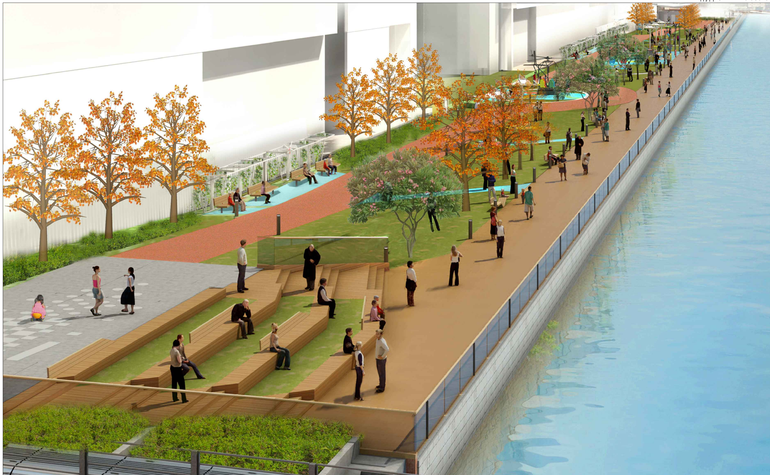
從西南面望向海濱的構思圖 PERSPECTIVE VIEW FROM SOUTH WESTERN DIRECTION (ARTIST'S IMPRESSION)

452RO 香港兒童醫院旁的海濱長廊 WATERFRONT PROMENADE ADJACENT TO THE HONG KONG CHILDREN'S HOSPITAL