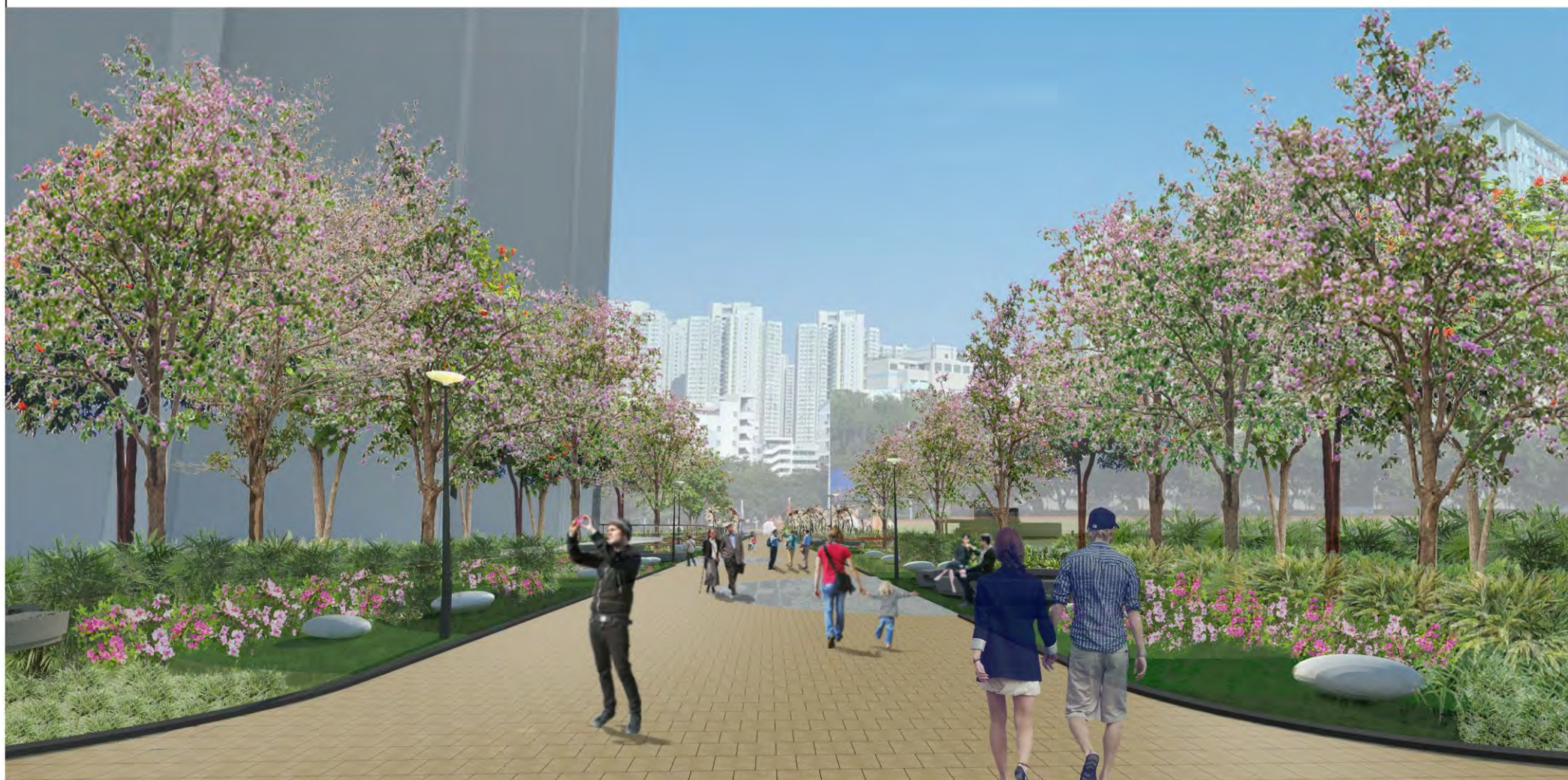
於林蔭大道的景觀透視圖 PERSPECTIVE VIEW ON TREE AVENUE