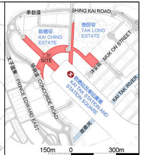
位置圖 LOCATION PLAN