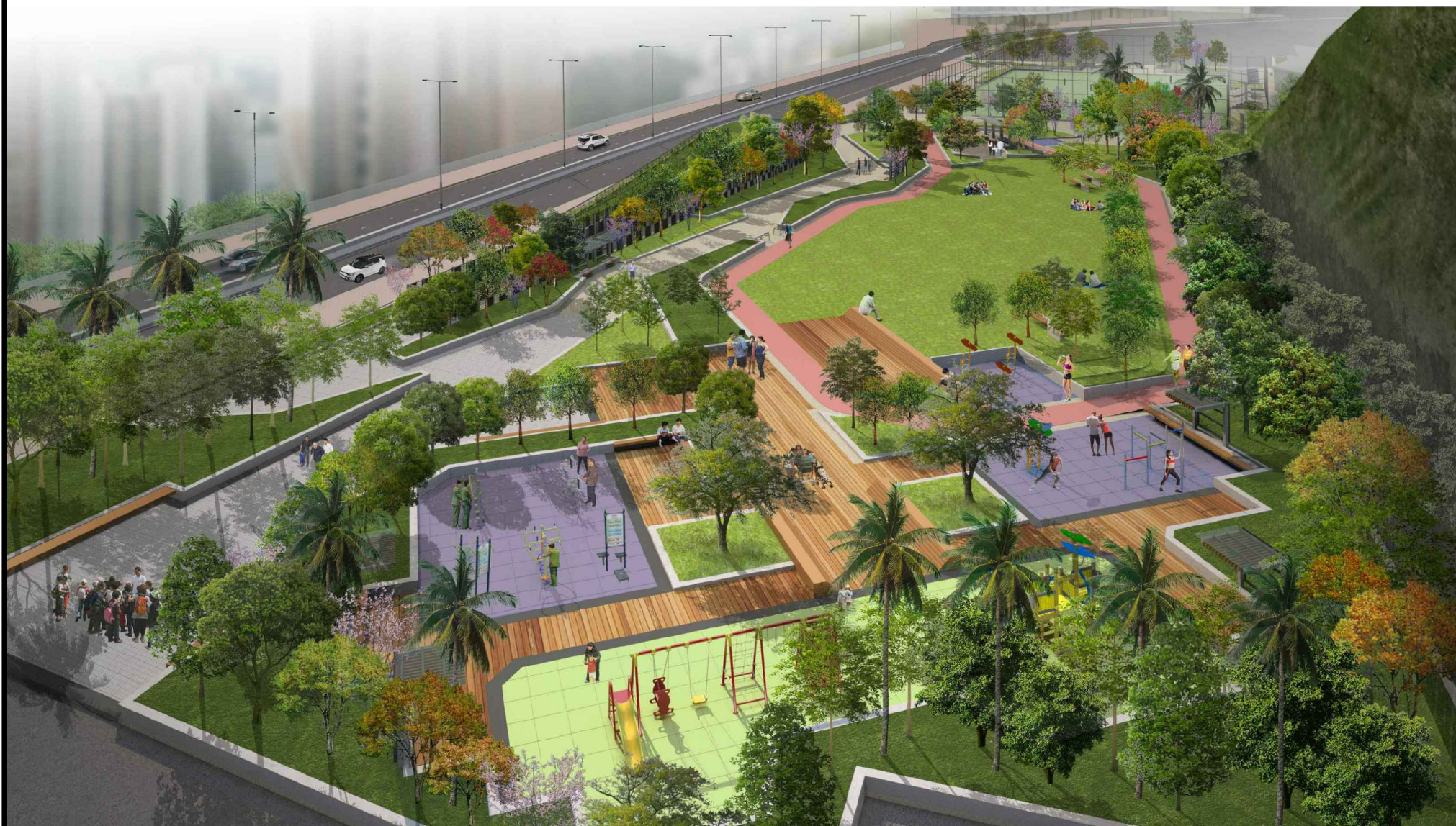
從東南面望向休憩用地的透視圖 PERSPECTIVE VIEW FROM SOUTH EASTERN DIRECTION

工務計劃項目編號 B440RO 毗鄰安達臣道公營房屋發展項目的地區休憩用地 PWP ITEM NO. B440RO