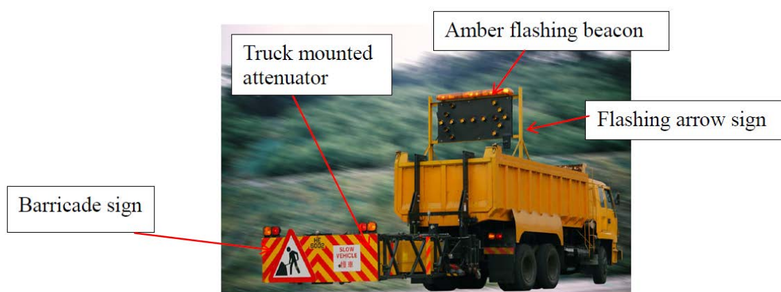
Figure 1: A shadow vehicle

When conducting mobile operations on expressways, it is necessary to use shadow vehicles. Shadow vehicles must be equipped with truck-mounted attenuator, amber flashing beacon, flashing arrow sign and barricade sign. Please refer to Figure 1 for the equipment of a shadow vehicle. According to the speed limit of the road and mode of operation, the works vehicle and shadow vehicle need to maintain a proper buffer distance ( Figure 2 ). The relevant requirement on buffer distance can be found in the Code of Practice for the Lighting, Signing and Guarding of Road Works.