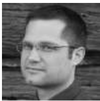
Pete Baklinski Follow Pete