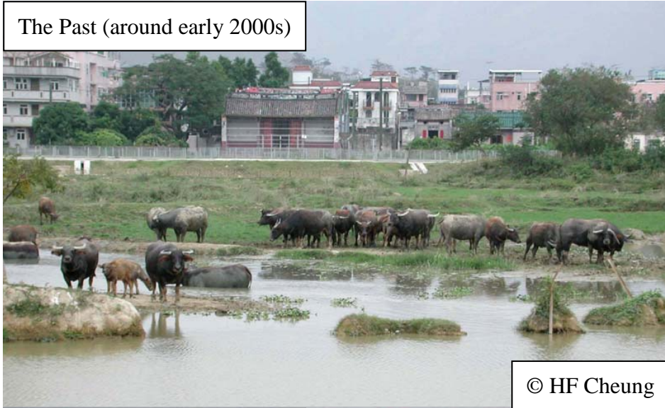
Figure 2. The Kam Tin Buffalo Field – Outlook of the landscape around early 2000s and the present state of the land.