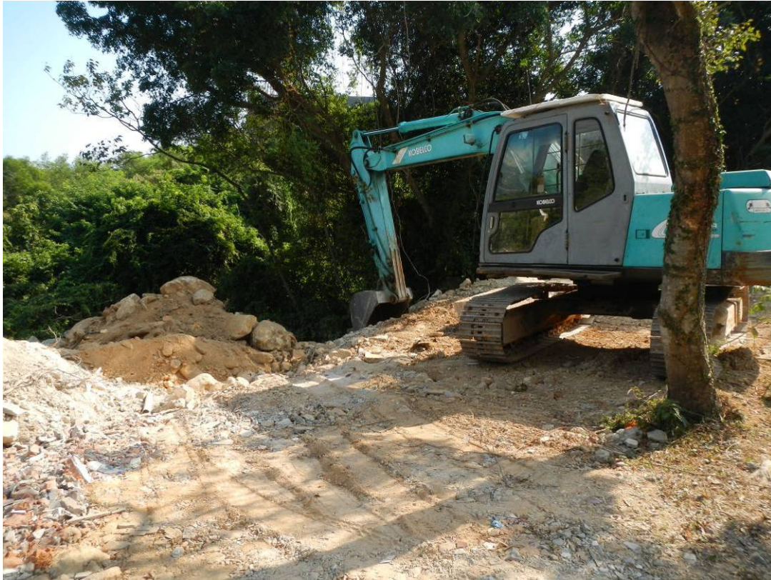
Figure 8. Other dumping sites in South Lantau