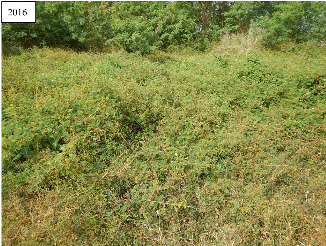
Figure 3. Exotic plant community at the Kam Tin Buffalo Field.