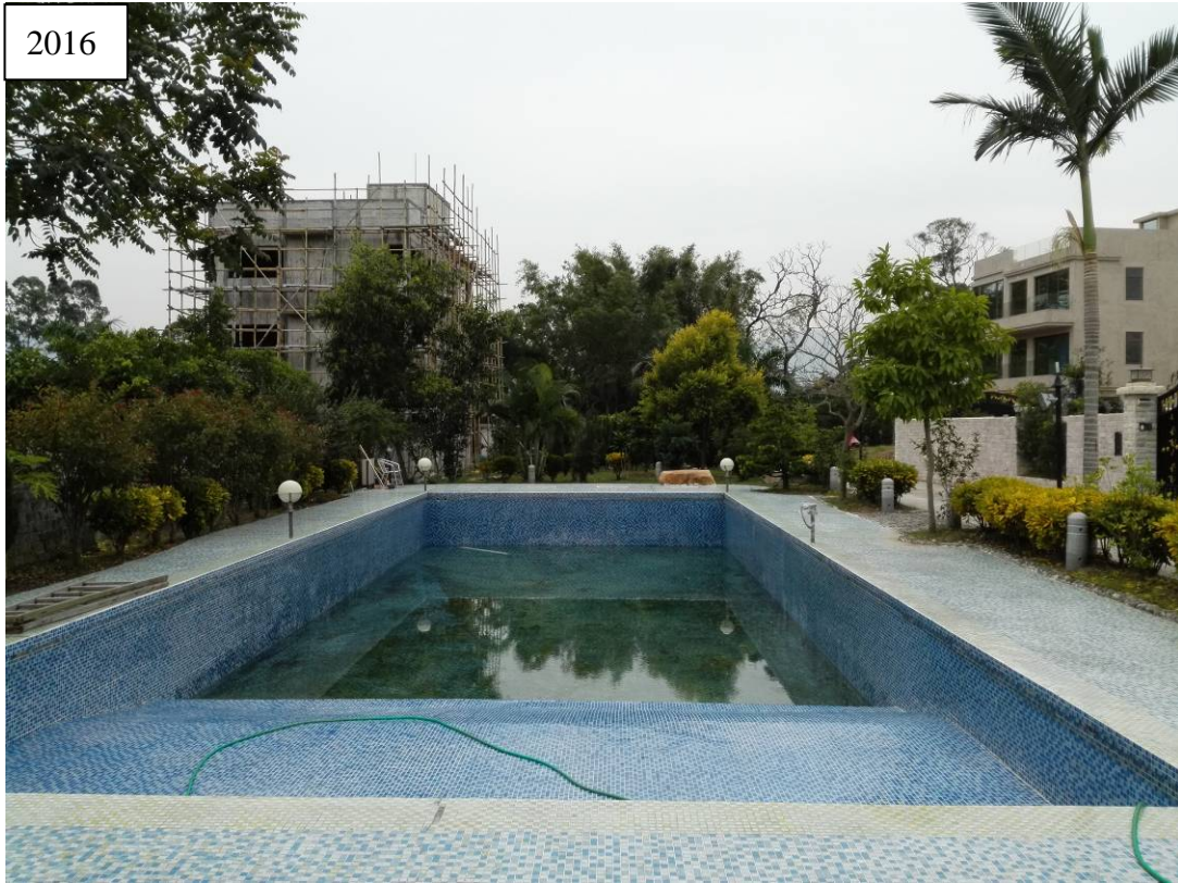
Figure 4. Cont'd.