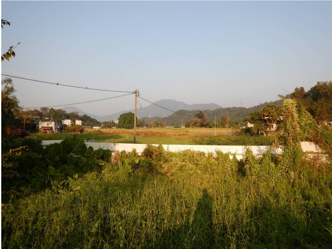
Figure 1. Present condition of the She Shan dumping site and its surroundings.