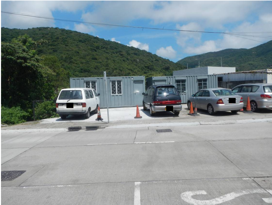
Figure 6. Cont'd.