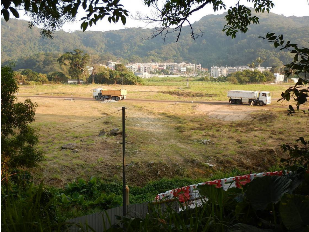
Figure 1. Cont'd.