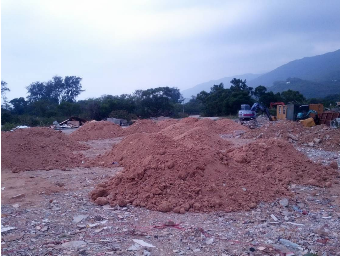
Figure 8. Cont'd.