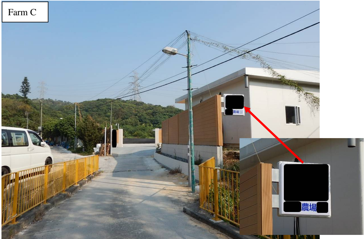
Figure 9. Cont'd.