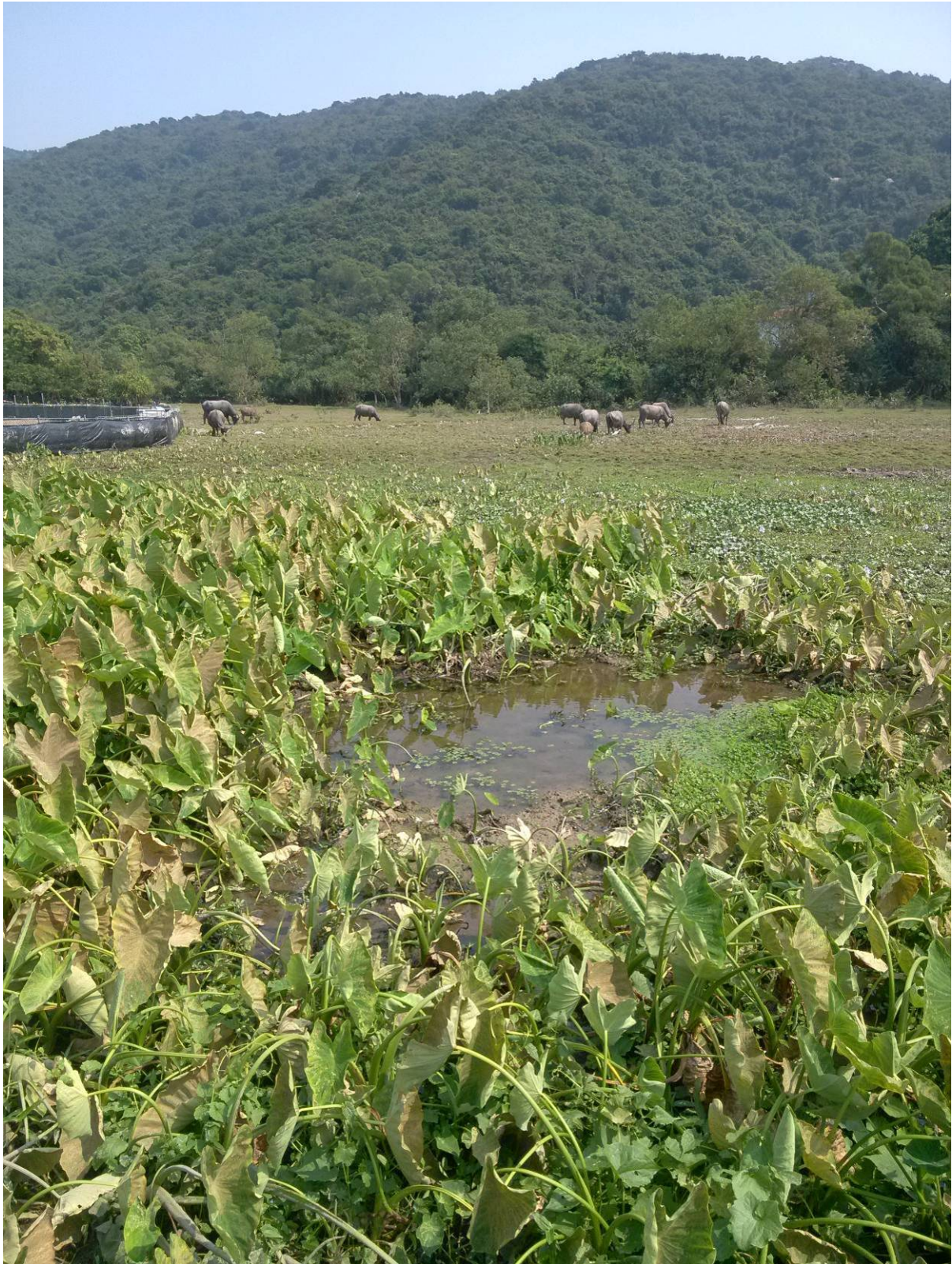
Figure 5. Buffalo field wetland at Pui O.