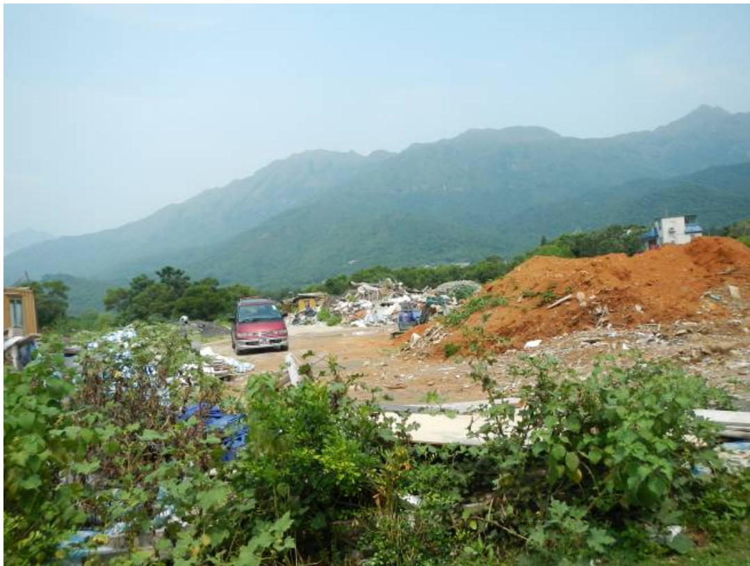
香港新界大埔林錦公路 Lam Kam Road, Tai Po, New Territories, Hong Kong Email: eap@kfbg.org