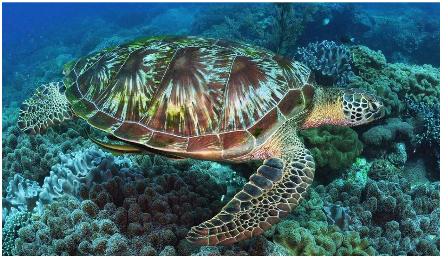
TABLE 6. CONFISCATION OF SEA TURTLE PRODUCTS FROM RETURNING TOURISTS AND INBOUND MAIL PACKAGES, 2015 - CURRENT (NON-EXHAUSTIVE)