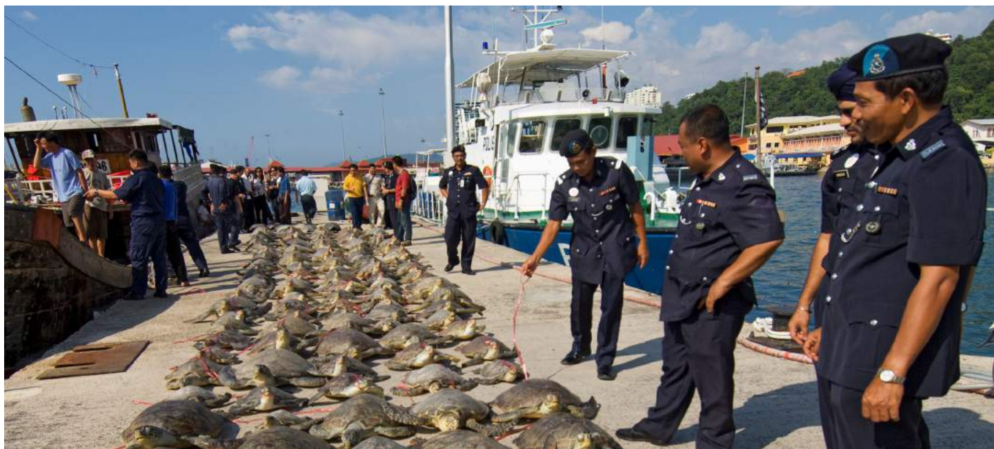
Sea Turtle Confiscation

k. http://www.dailymail.co.uk/wires/afp/article-4674788/Philippine-police-arrest-rare-sea-turtle-poachers.html