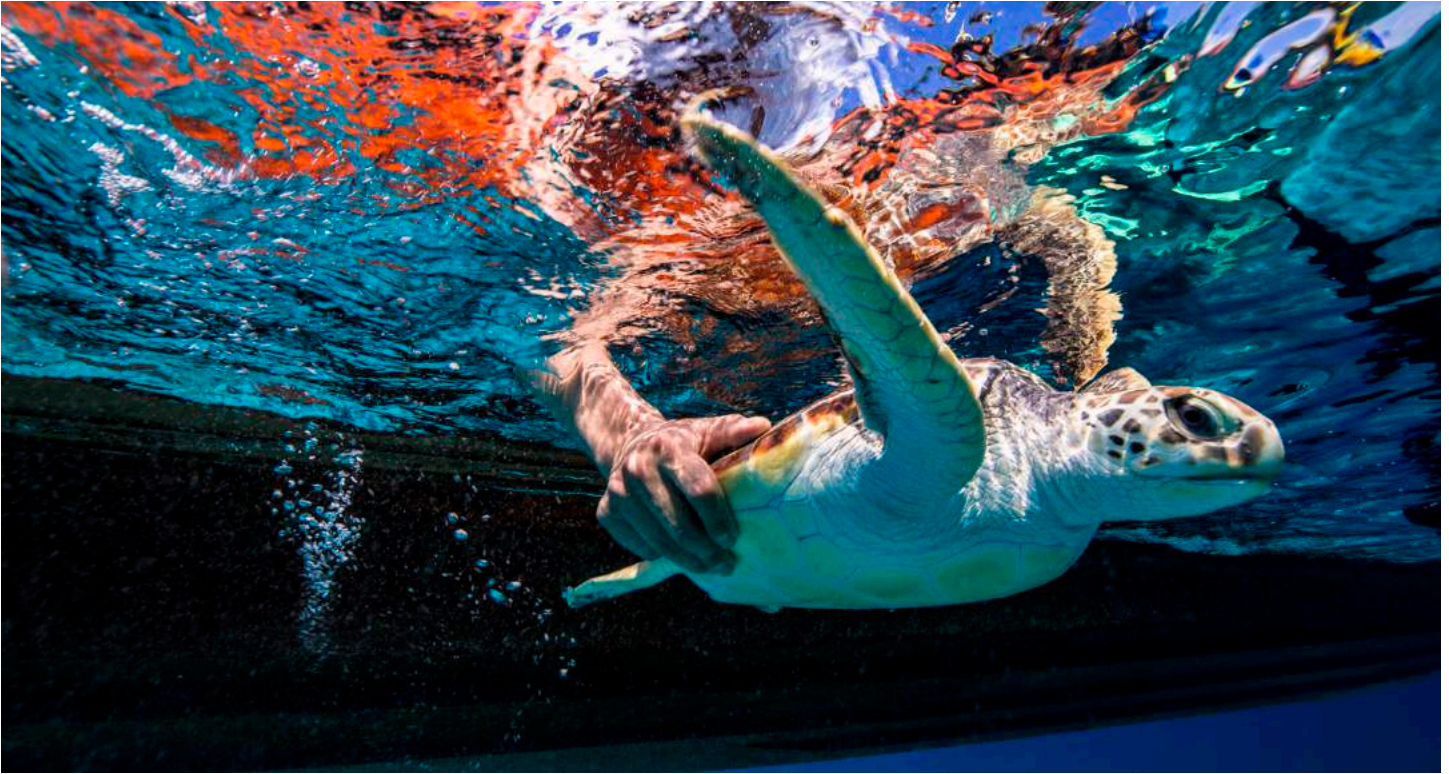
WildAid ambassador and actor Liu Ye releases a rescued sea turtle in the Paracel Islands

sale of tridacninae and its products. Although not targeting sea turtle products directly, the close association and clustering of the processing and sale of different marine wildlife products and the increase in law enforcement action against the sale of these products have generated direct impact on the industry overall as well as the economy of Tanmen, Qionghai, which used to depend on the processing and sale of the tridacninae and similar marine wildlife products.