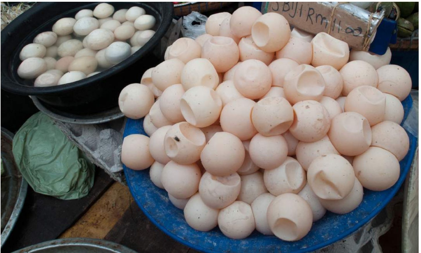
Turtle eggs for sale in Malaysia

Despite geographic separation, some common trends emerge across countries that consume turtle products. For example, several regions that use turtle parts for their medicinal effects commonly believe that consuming turtle parts can help cure asthma and improve male virility. The following table summarizes some representative drivers across regions that consume sea turtle products.