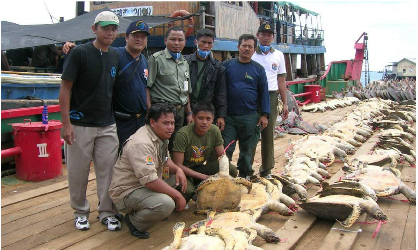
Sea Turtle Bust

“arts and crafts” market in Angola targeting mostly Chinese customers sell both ivory products and whole hawksbill taxidermies, and the San Jiang Market in the Laotian capital of Vientiane sell ivory, rhino horn, tiger bones, and hawksbill turtles side by side. 24