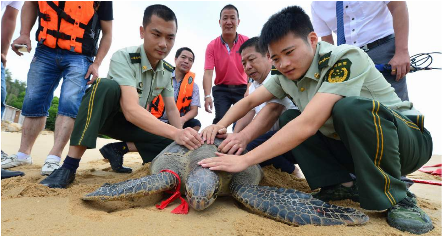
An accidentally-caught green turtle is released in Fujian Province

overall sustainability of sea turtle populations along China's coast, there are significant limitations to their effect on the country's impact on turtle populations globally, as these reserves predominantly target green turtles, rather than hawksbills.