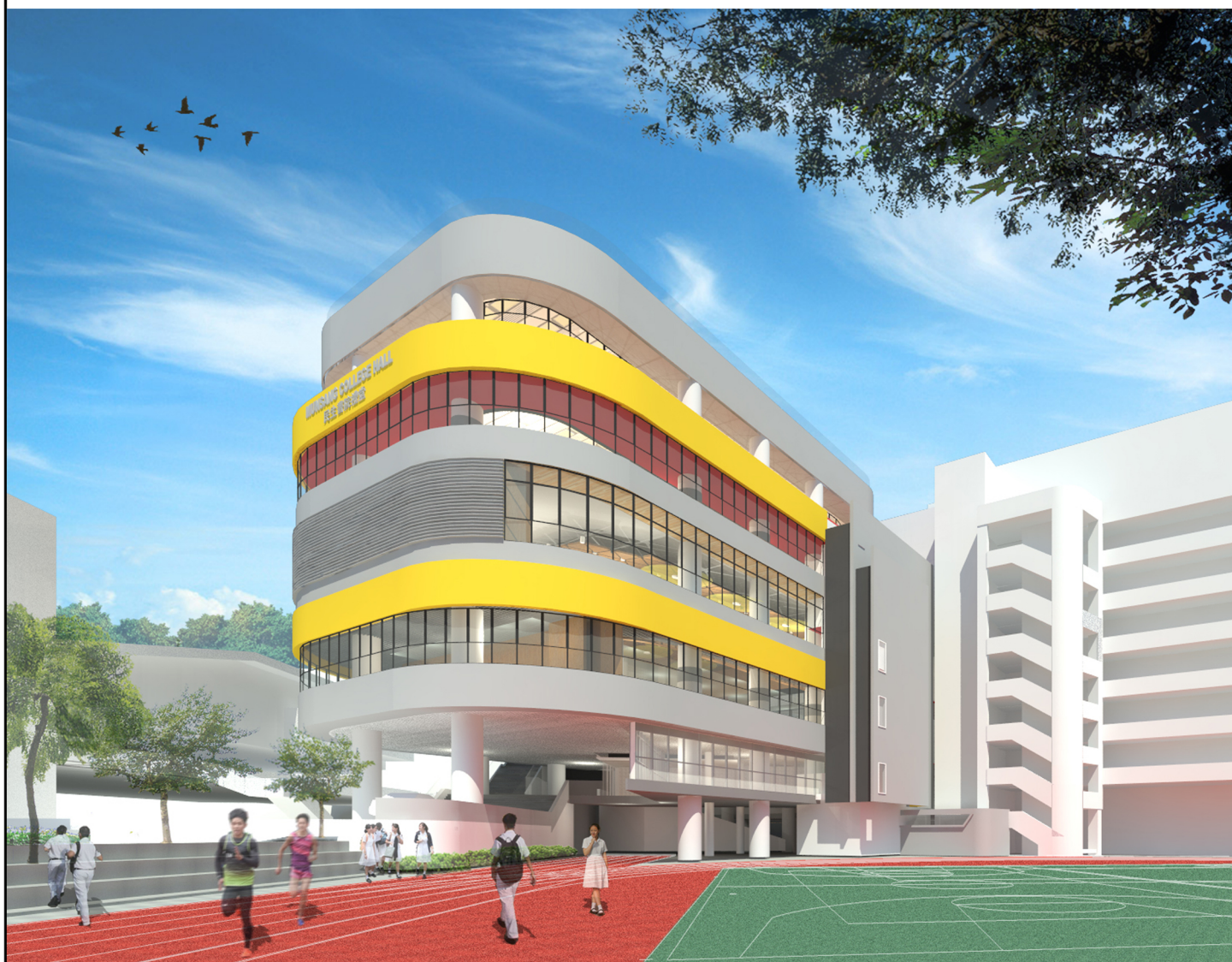
從足球場望向新禮堂大樓的構思透視圖 PERSPECTIVE VIEW FROM FOOTBALL FIELD