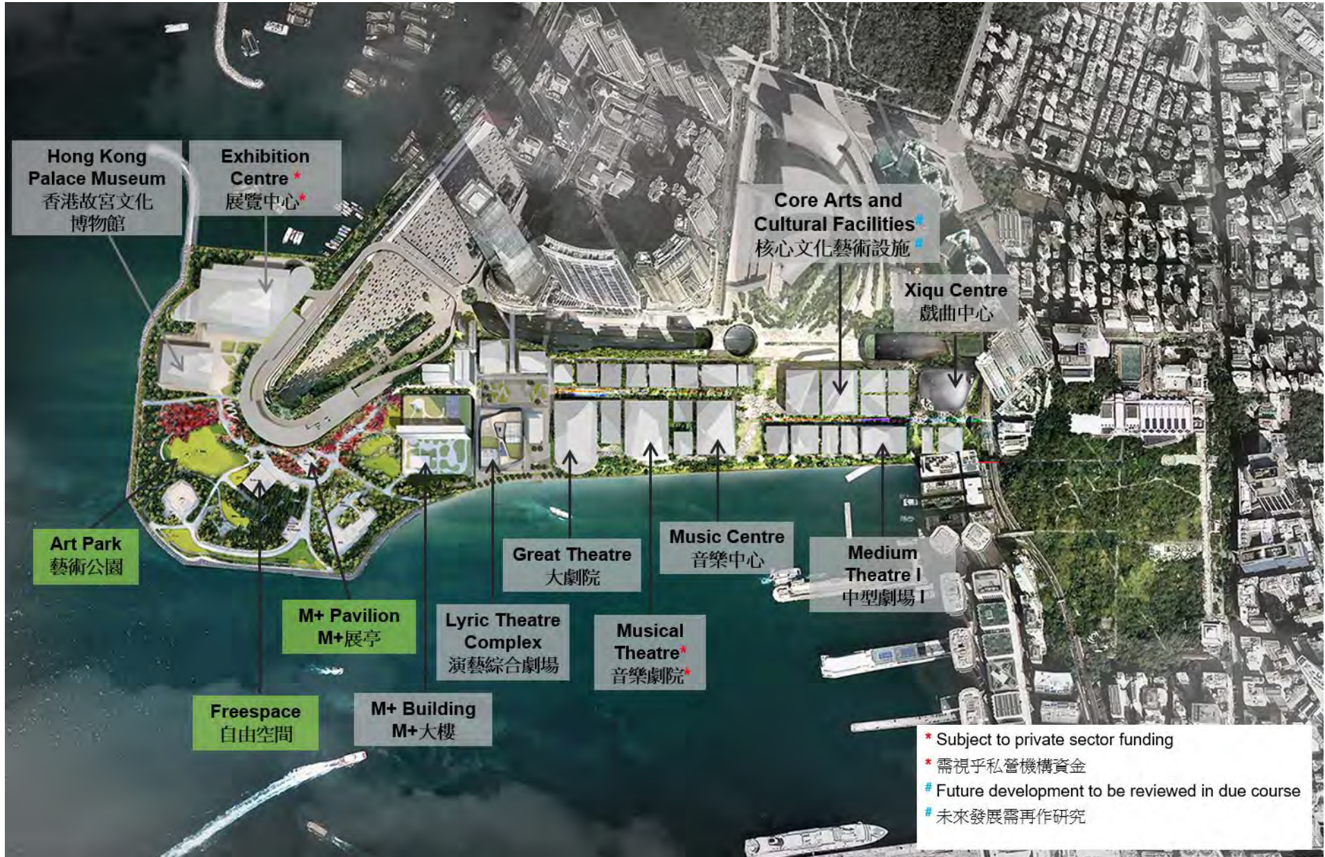
Annex 3: Location of the Art Park, M+ Pavilion and Freespace