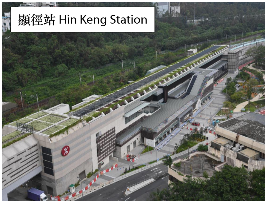
顯徑站 Hin Keng Station