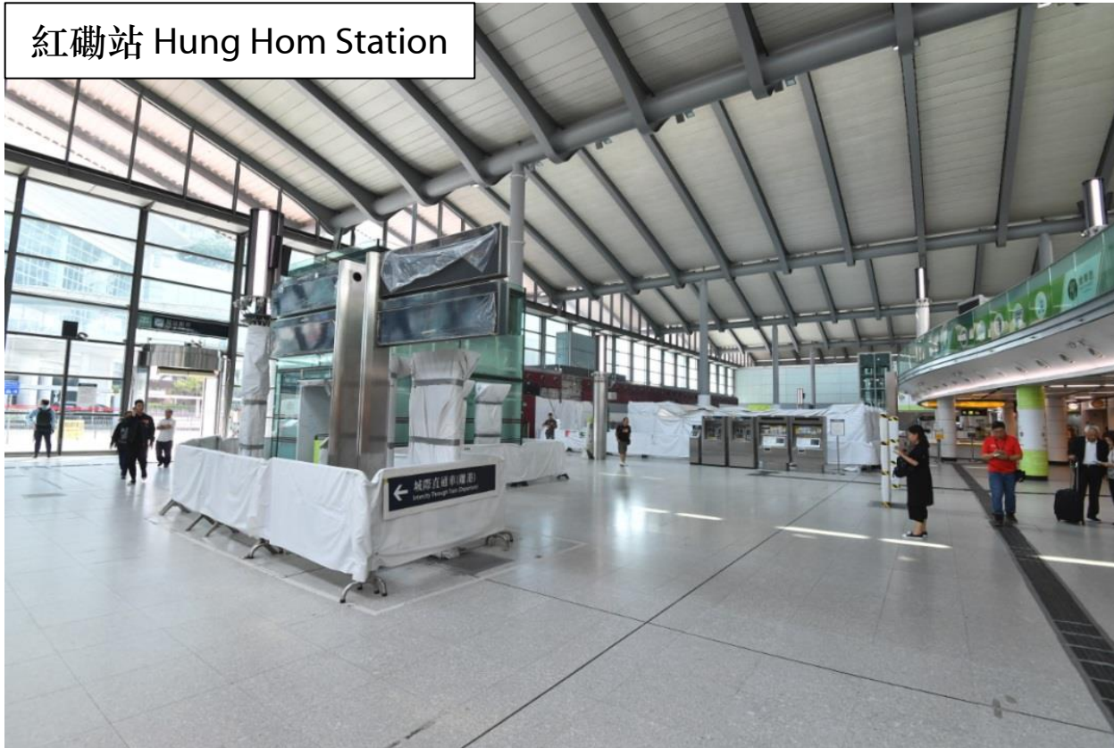
紅磡站 Hung Hom Station