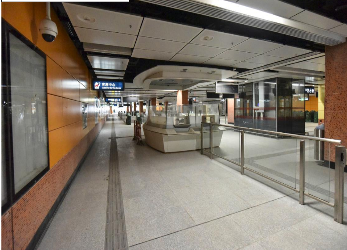
啟德站 Kai Tak Station