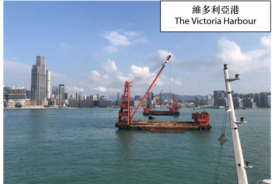
維多利亞港 The Victoria Harbour