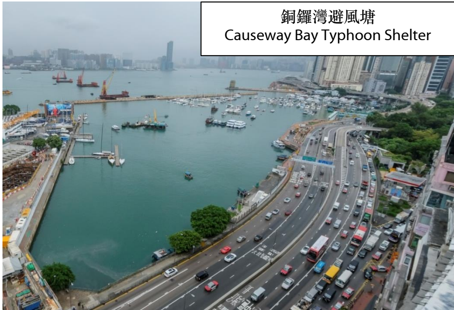
銅鑼灣避風塘 Causeway Bay Typhoon Shelter