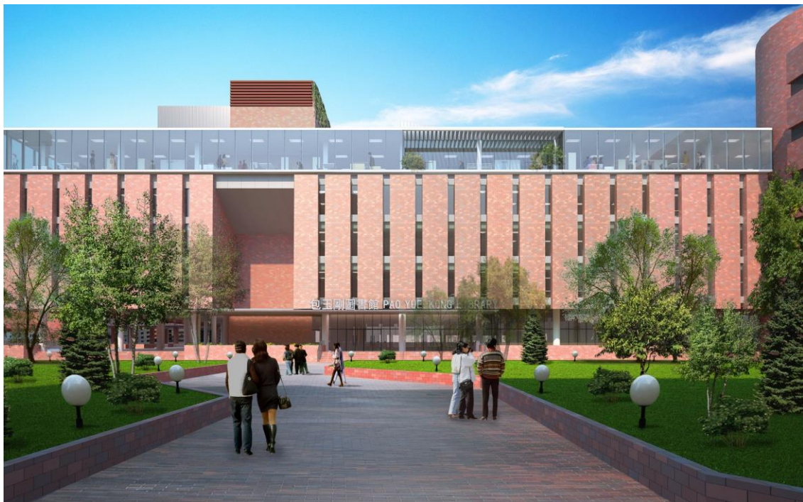
從大學校園望向圖書館擴建部分的構思圖 View of the library extension from the university campus (Artist's impression)