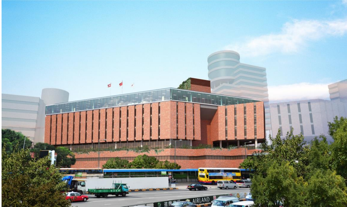
從紅磡海底隧道望向圖書館擴建部分的構思圖 View of the library extension from Hung Hom Cross Harbour Tunnel (Artist's impression)