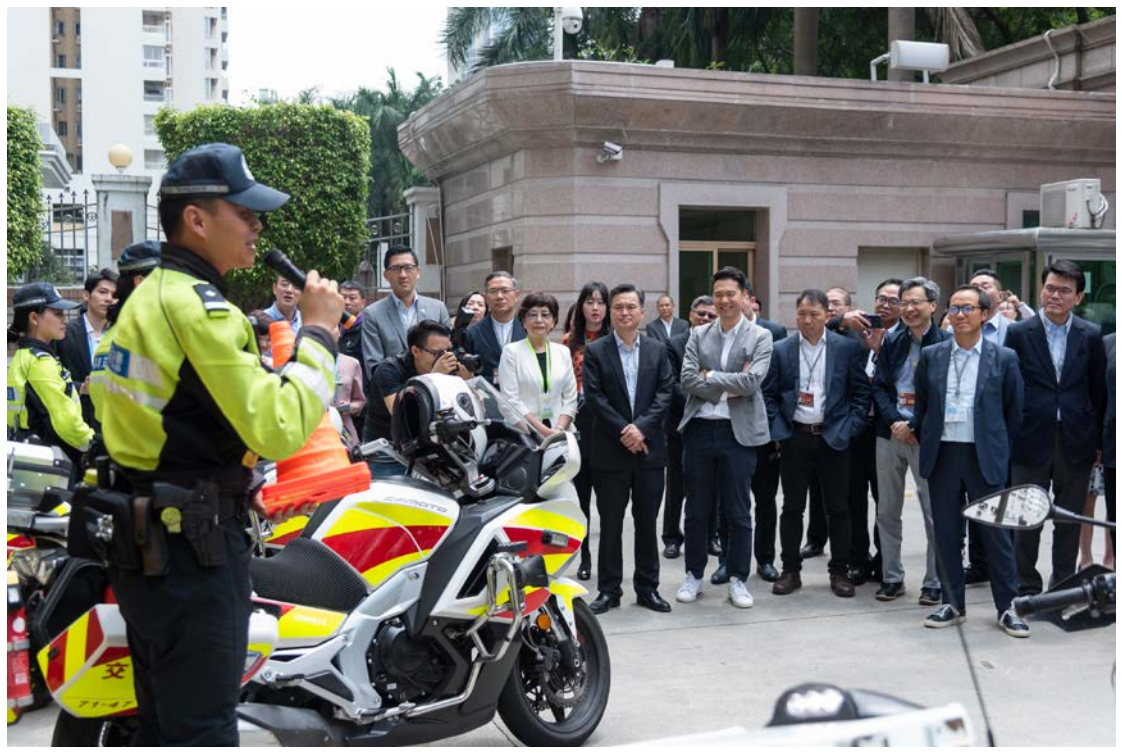
Representative of the Intelligent Traffic Command Centre of the Traffic Police Bureau of Shenzhen Municipality briefs the Delegation on the work of the Centre

2.11 Some Members consider that the traffic control and surveillance systems concerned, which are more advanced than those in Hong Kong, offer value for money despite the higher cost involved. As regards the feasibility of introducing the relevant surveillance technology into Hong Kong, Members are generally of the view that such technology can hardly be implemented in near future, given the need to go through a lot of procedures and the time required for obtaining approval from LegCo. Pointing out that the people in Hong Kong may not want to have too many surveillance devices mounted on streets, some Members caution that issues relating to protection of personal privacy must be considered when introducing similar traffic surveillance systems into Hong Kong.