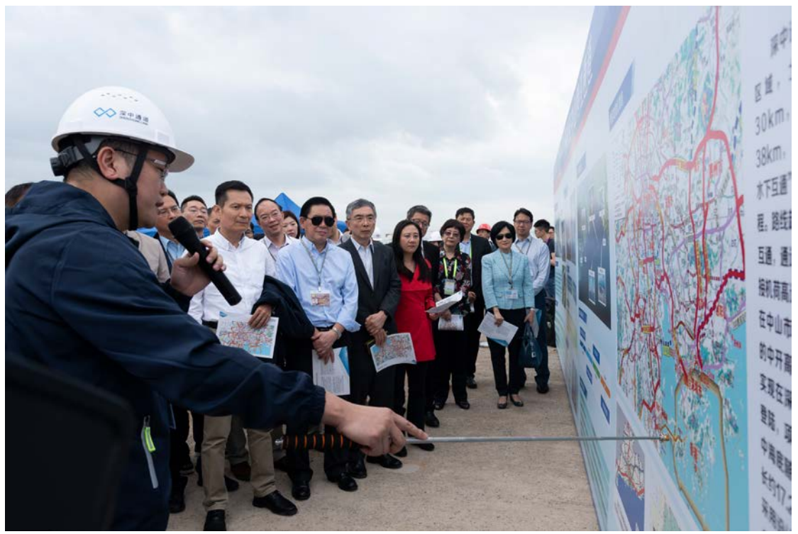
The Delegation receives a briefing on the Shenzhen-Zhongshan Link at the west landing point of the link

4.7 During the visit to the Shenzhen-Zhongshan Link West Landing Point, relevant persons-in-charge, with the aid of the display boards set up on site, briefed the Delegation on the geographical location of and construction plan for the Shenzhen-Zhongshan Link. The Delegation notes that the main works of the Shenzhen-Zhongshan Link commenced in end 2016 and the link is scheduled for commissioning in 2024. Upon commissioning, it will provide an important access linking the city clusters in eastern and western PRD. As the travelling time between Zhongshan and Shenzhen will then be reduced significantly from 2 hours to 30 minutes, the traffic pressure on the Humen Bridge will be relieved.