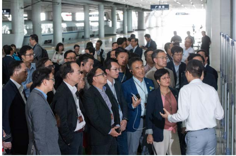
The Delegation visits Guangzhou South Railway Station to learn about the planning and traffic conditions surrounding Guangzhou South Railway Station and the latest development of the high-speed rail network