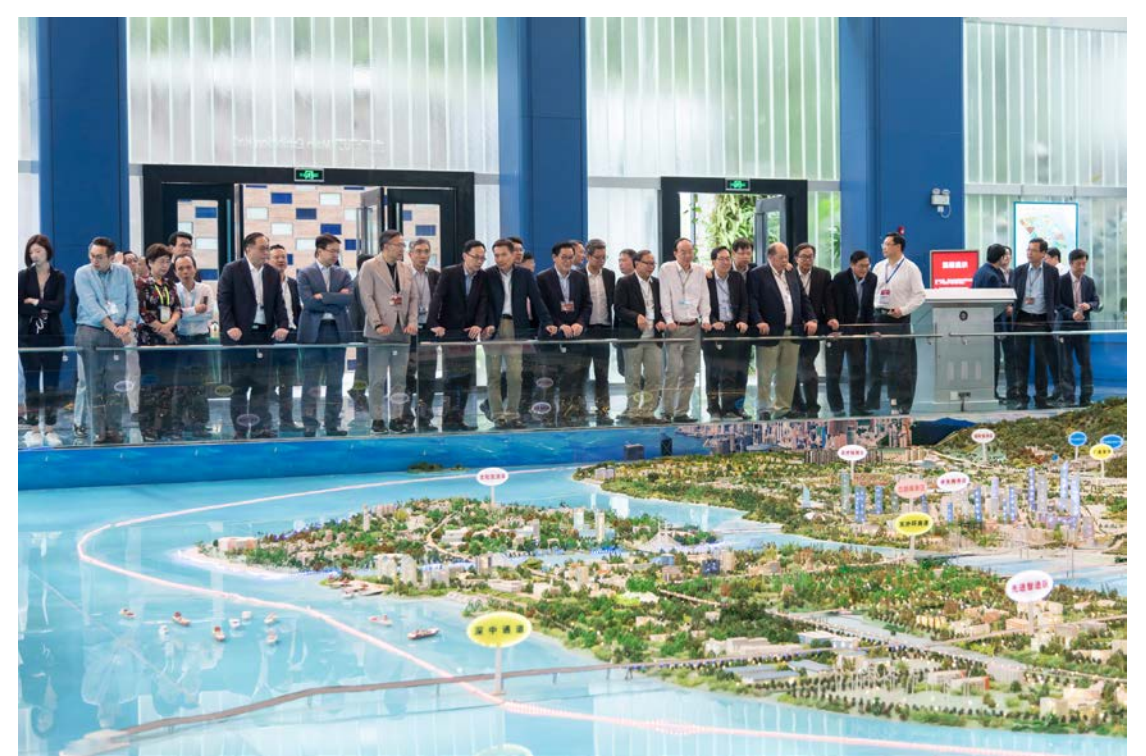
The Delegation visits the Tsui Hang New District Planning Exhibition Centre to learn about the planning for the district