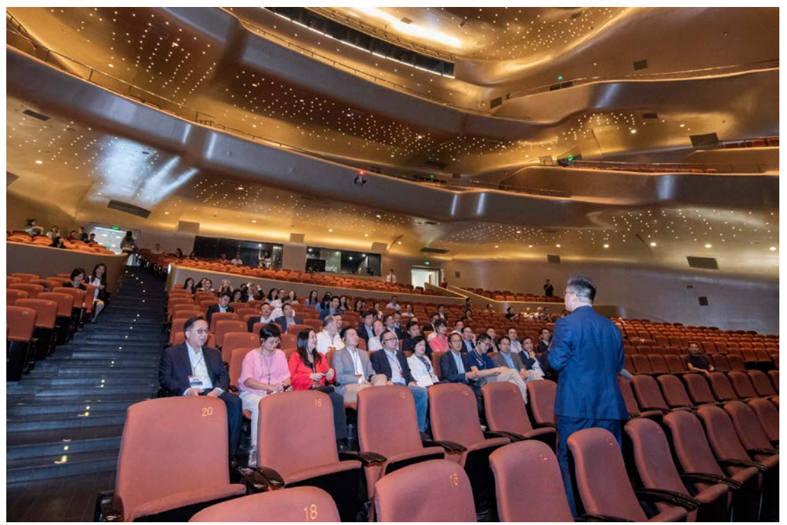
The Delegation receives a briefing on the Guangzhou Opera House