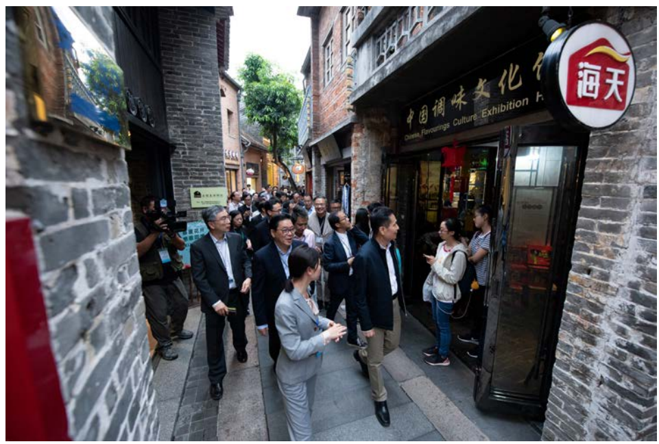
The Delegation visits Lingnan Tiandi to learn about the heritage conservation and old town renewal work

5.11 Guided by the persons-in-charge of Lingnan Tiandi, the Delegation toured along Zumiao Street and walked through the Wine Club, Li Zong Sheng Ancestral Shop, Wong Cheung Wah U-I Oil Ancestral Shop, etc. During the tour, the Delegation was briefed on the heritage conservation and old town renewal in Lingnan Tiandi. The tour ended at the Kan's Villa, the largest, well preserved western-style architecture of the early Republican era and also a provincial-level conserved heritage building in Foshan.