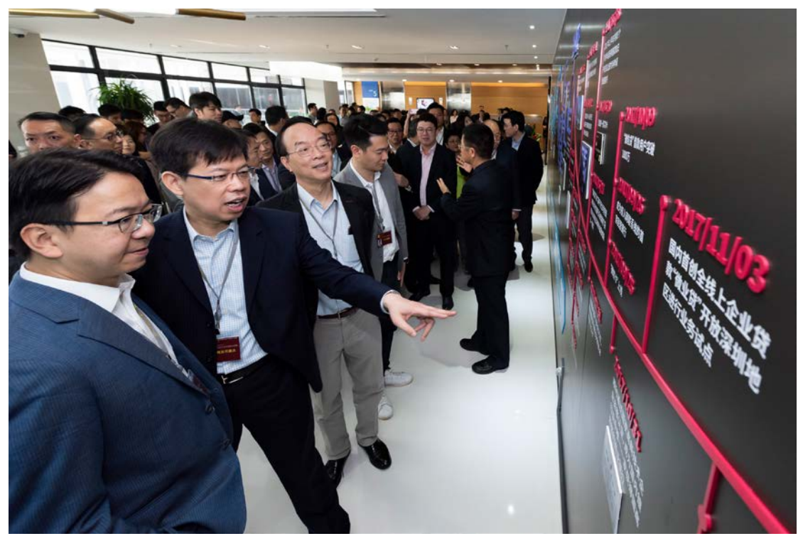
The Delegation visits the headquarters of WeBank in Shenzhen to understand the unique role, development strategy and application of financial technologies of the online-only bank