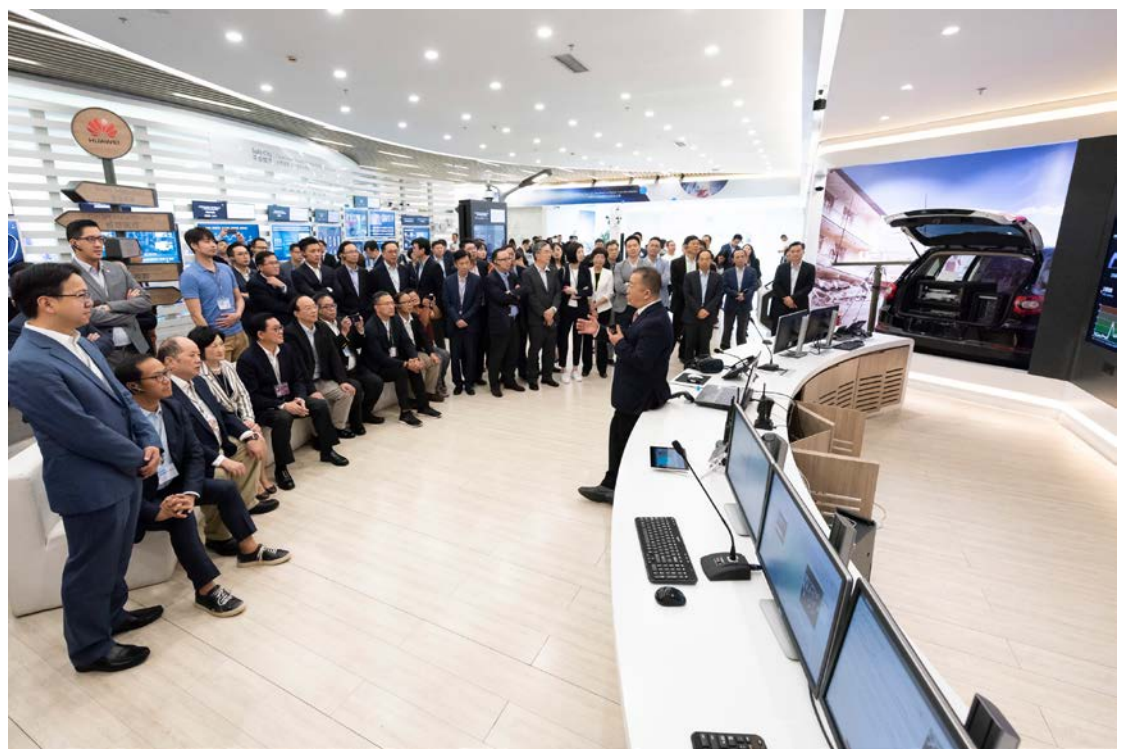
The Delegation learns about the application of technologies for smart city in the Huawei Bantian Headquarters

2.15 Members point out that many of the facilities and systems showcased by Huawei Technologies Co., Ltd. can be applied to Hong Kong to solve various urban management problems. For instance, the company's road monitoring system can help ameliorate traffic congestion. The authorities can also make use of Huawei's technologies for dealing with major accidents to improve the emergency preparedness of government departments by using monitoring systems. Members urge that some ready-made technologies should be applied to Hong Kong as soon as possible so that Hong Kong will not lag behind other places in terms of technology development and urban management.