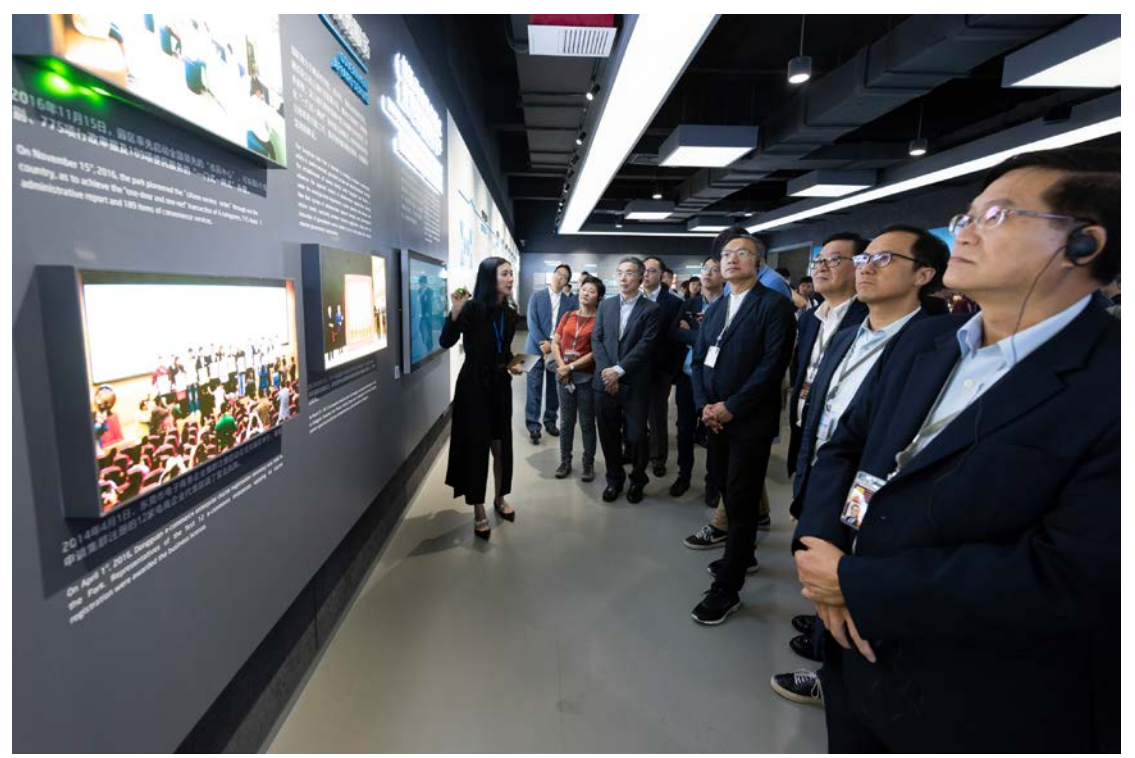
The Delegation receives a briefing on Songshan Lake High-tech Zone in Songshan Lake Eco-city Science Museum in Dongguan

3.9 Under the special arrangement of the Science Museum, representatives of Hong Kong-owned enterprises interacted and exchanged views with members of the Delegation. They also introduced their products and shared their entrepreneurial experience with members of the Delegation. According to the Science Museum, there are currently about 128 Hong Kong-owned enterprises in the park with a registered capital of RMB 26 billion.