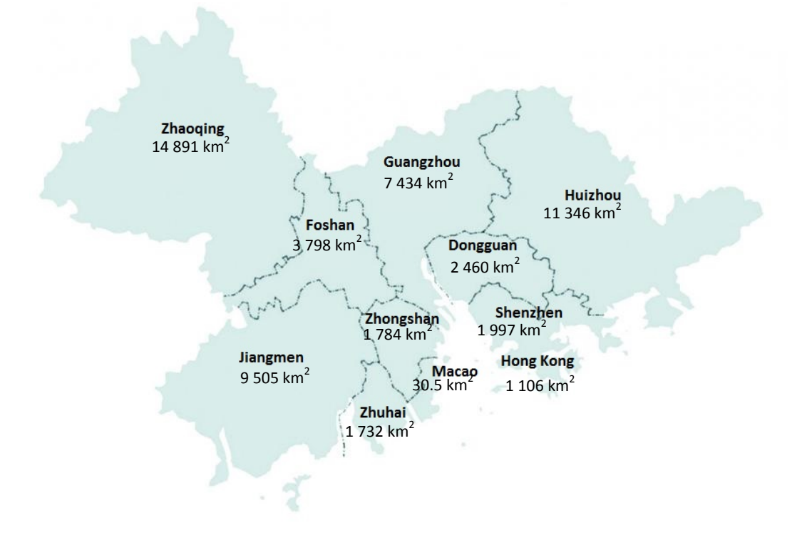
Figure 1 — Graphical map of the Guangdong-Hong Kong-Macao Greater Bay Area in 2016

1.2 The Bay Area is a city cluster consisting of "nine cities and two regions", i.e. the nine adjoining cities in the Pearl River Delta ("PRD") region, namely Shenzhen, Dongguan, Huizhou, Guangzhou, Zhaoqing, Foshan, Zhongshan, Zhuhai and Jiangmen, as well as the two Special Administrative Regions of Hong Kong and Macao ( Figure 1 ). The Bay Area has a land area of approximately 56 000 square kilometres. In 2016, it had a permanent population of around 67.74 million, with a total gross domestic product ("GDP") of around US $1,387.9 billion and a per capita GDP close to US $20,500.