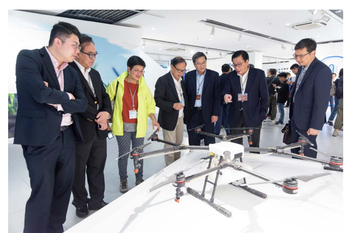
The Delegation views the exhibits in Songshan Lake Xbot Park