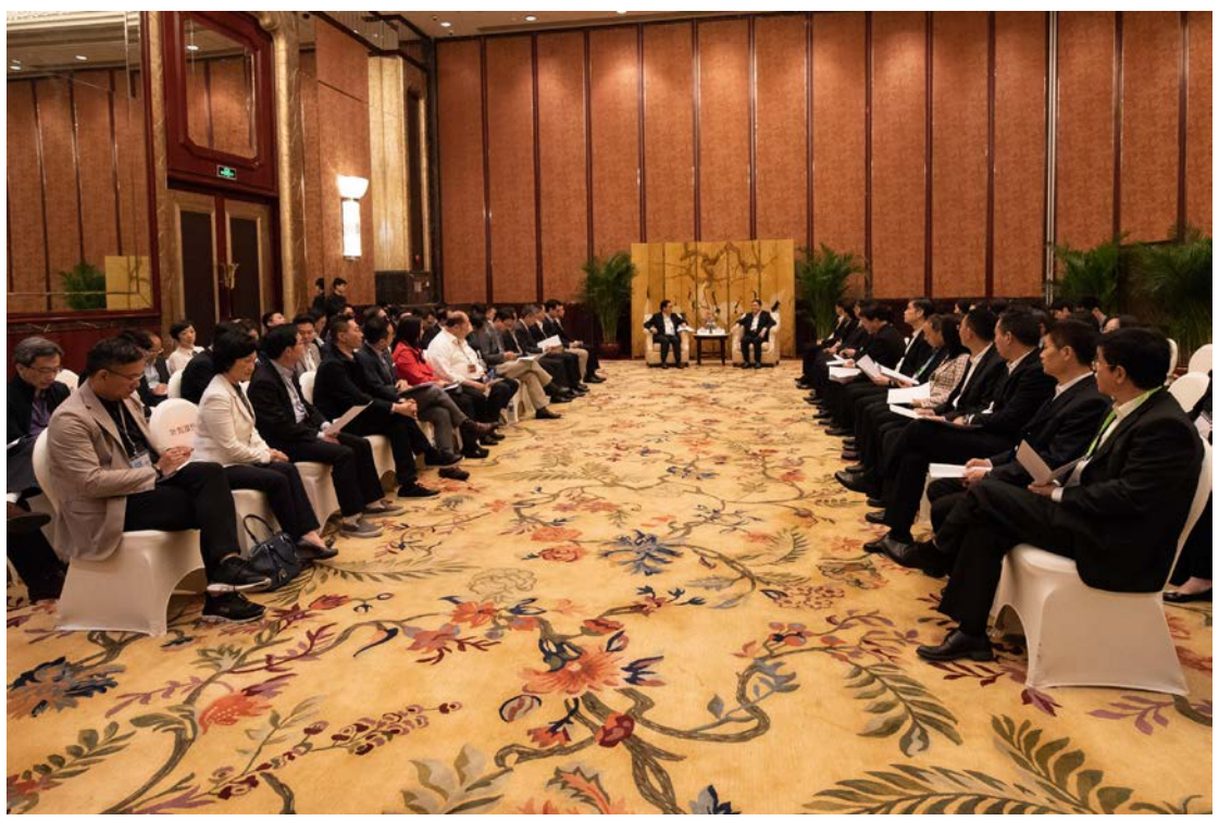
The Delegation meets with representatives of the Guangzhou Municipal Government to exchange views on cooperation opportunities between Guangzhou and Hong Kong in the Bay Area