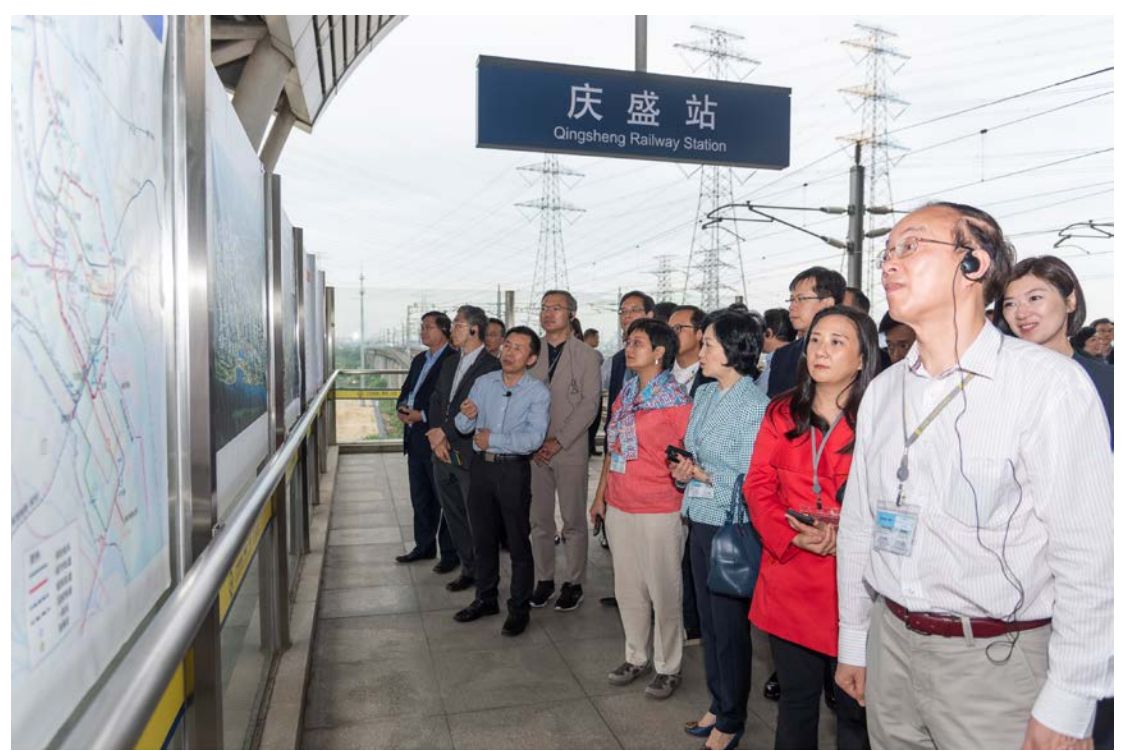
The Delegation visits Qingsheng High-speed Railway Station in Nansha to learn about the highways and rail networks linking the east and west banks of the Pearl River estuary and the development of Nansha District