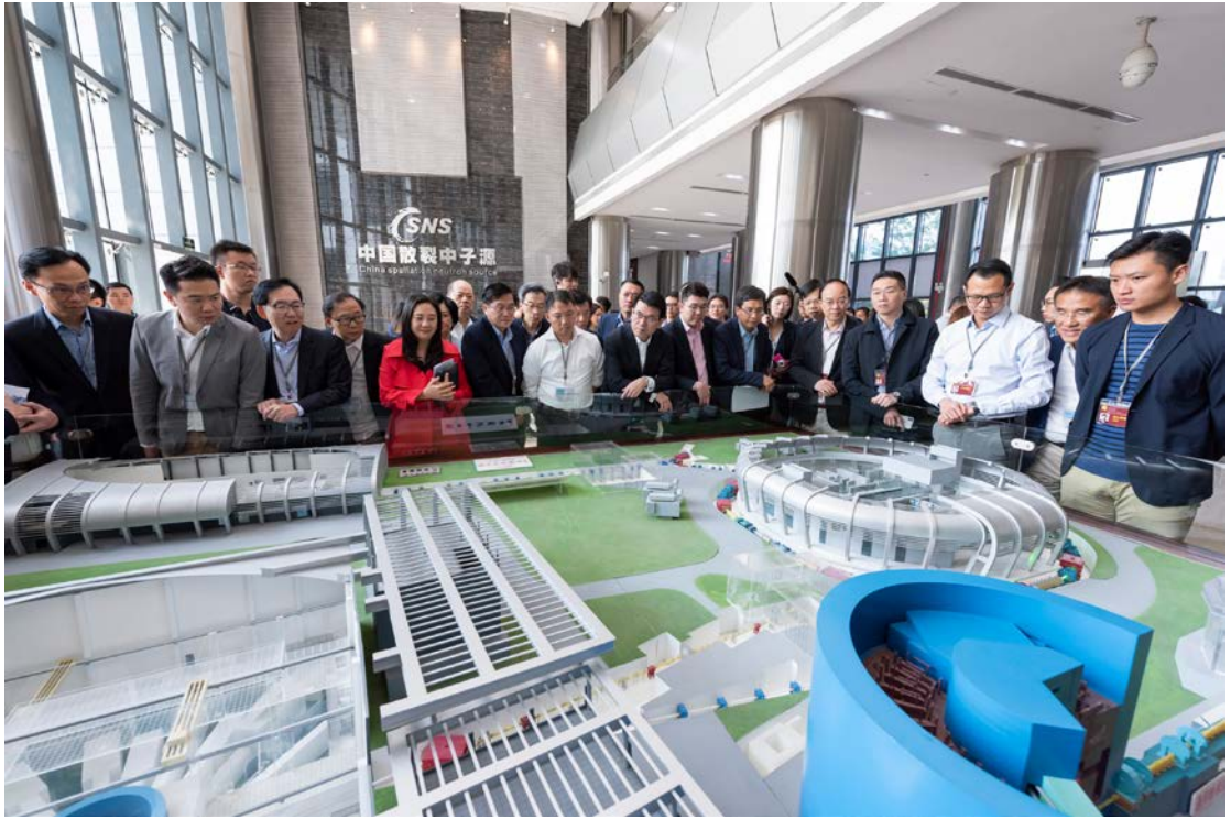
Delegation members learn about the instruments in CSNS through exhibition models

3.12 The Delegation considers that CSNS is an important facility for promoting innovation and technology development in the Bay Area, and provides strong support for the future technology development in the Bay Area. The Delegation is delighted to learn that the high-tech facility is open for users from home and abroad free of charge, and considers that the higher education and research institutions in Hong Kong should, leveraging on the geographical advantage of their location in the Bay Area, make proper use of CSNS to enhance Hong Kong's scientific research and foster the development of collaboration projects with the research institutions on the Mainland.