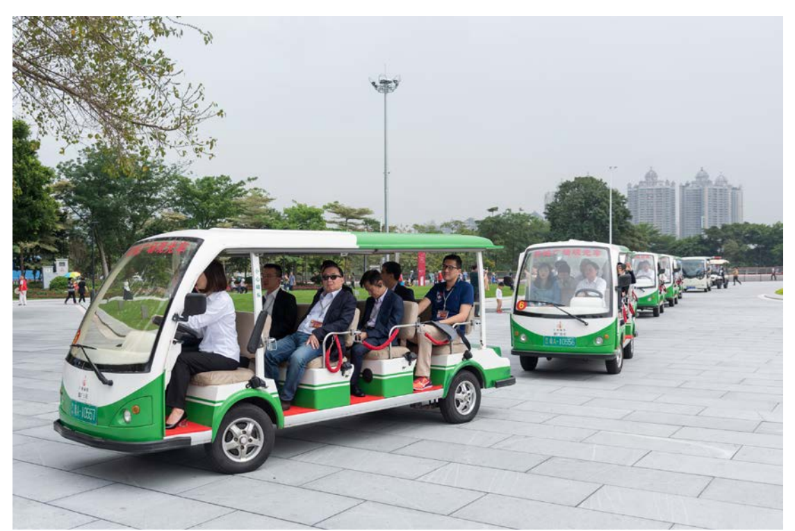
Delegation members take a ride on electric vehicles to tour around the cultural landmarks in the Zhujiang New Town