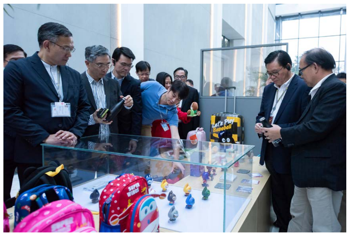
The Delegation views the products of Hong Kong-owned enterprises displayed in Songshan Lake Eco-city Science Museum