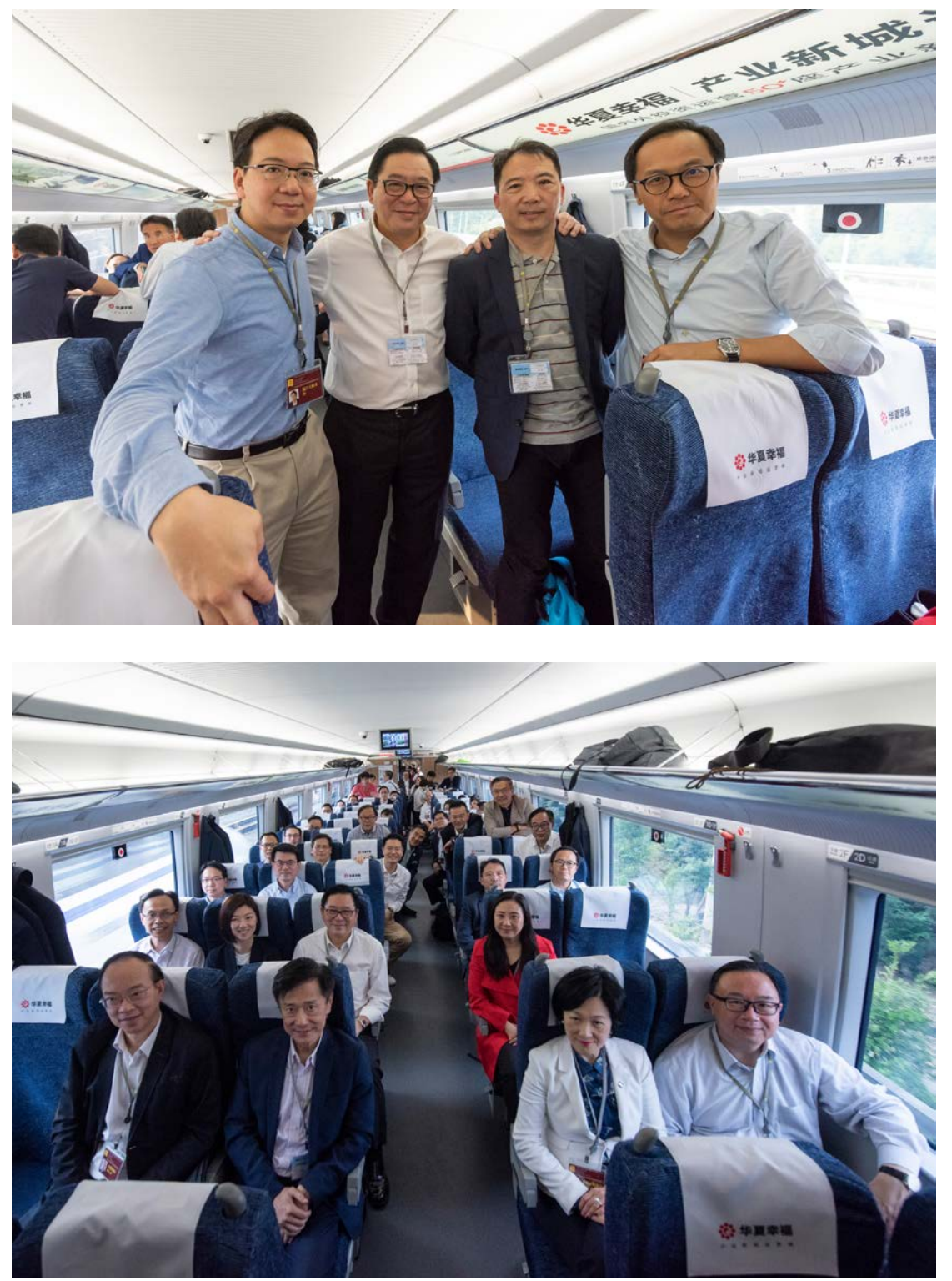
The Delegation concludes the visit by taking a ride on the high-speed train from Guangdong South Railway Station to Futian Station in Shenzhen