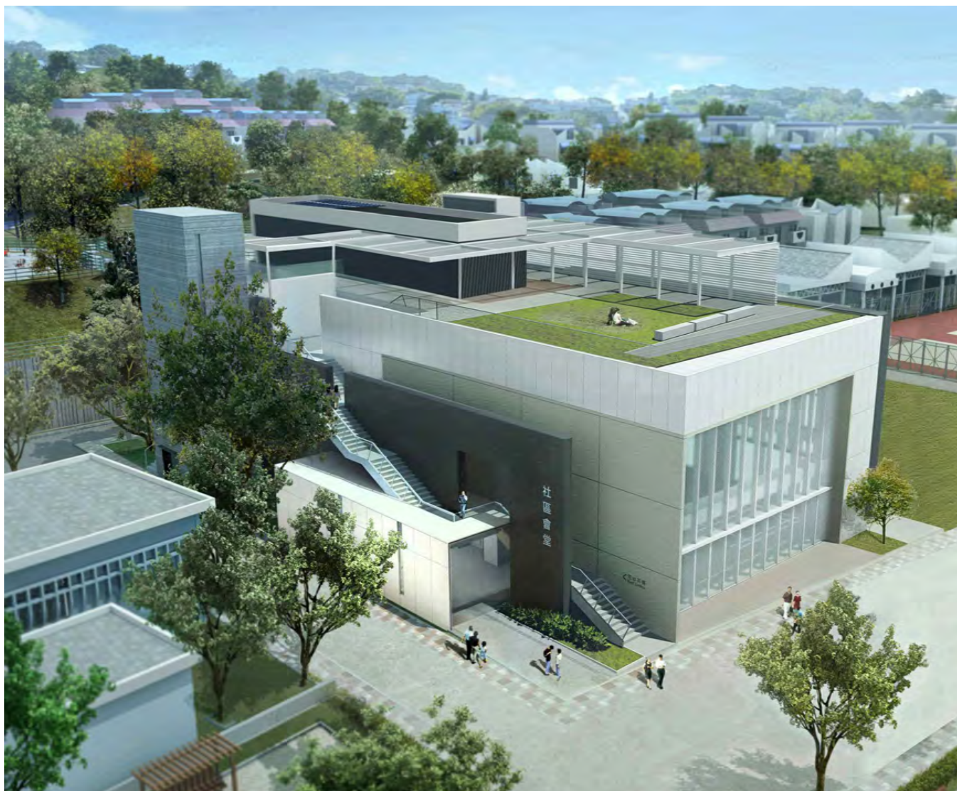
從東北面望向大樓的構思透視圖 PERSPECTIVE VIEW FROM NORTH EAST DIRECTION