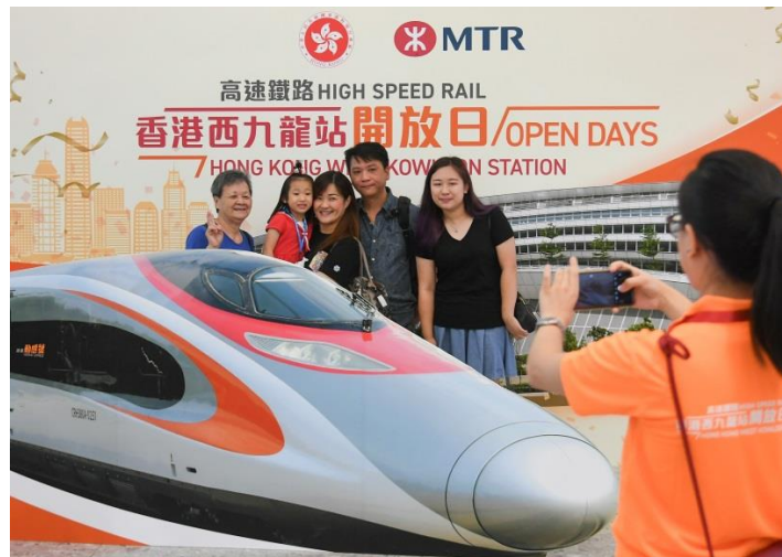
Around 20,000 visitors enjoyed fun and memorable experiences at the Hong Kong West Kowloon Station Public Open Days

5. The Hong Kong Section of the XRL was commissioned on 22 September 2018 and formally commenced operation on the following day (23 September 2018) to provide passengers with a brand new experience in cross-boundary travel.