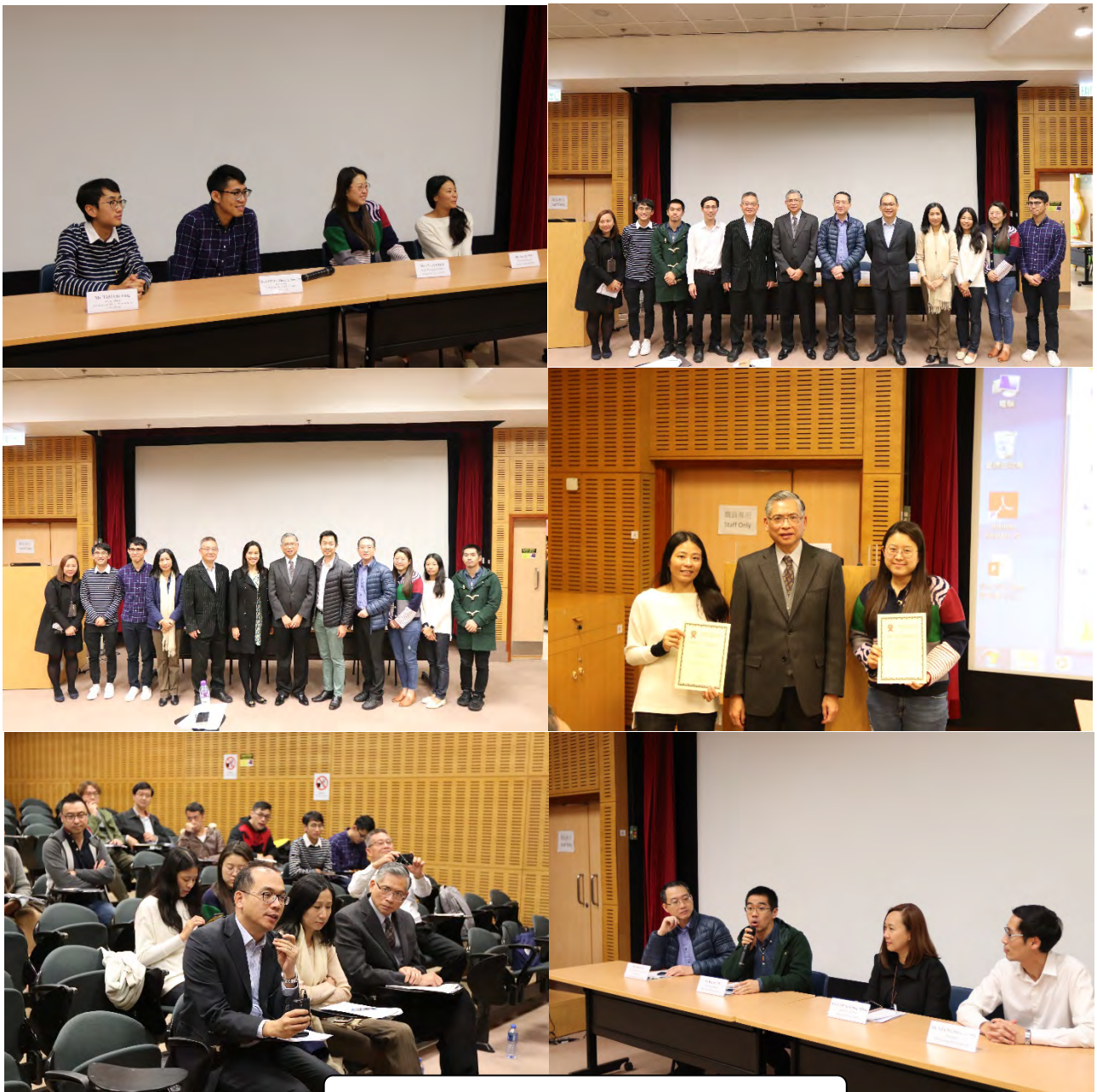
ATF Sharing Session on 11 January 2019

A sharing session was held on 11 January 2019. The session served as a platform for grantees to share their experience on HIV prevention and control in priority communities, as well as AIDS-related research through their programmes supported by the Fund.