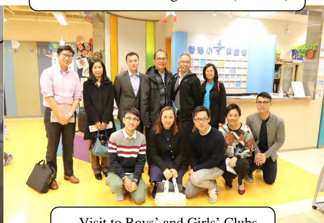
Visit to Boys' and Girls' Clubs Association of Hong Kong