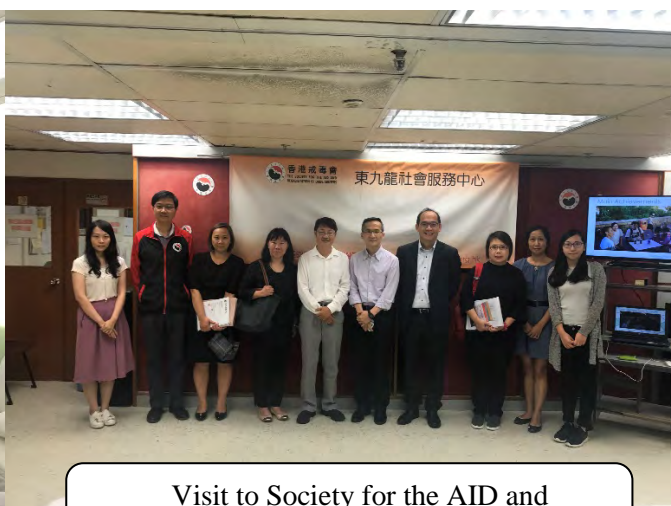
Visit to Society for the AID and Rehabilitation of Drug Abusers (SARDA)