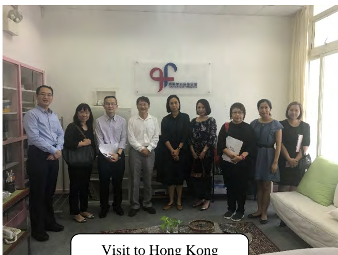
Visit to Hong Kong AIDS Foundation