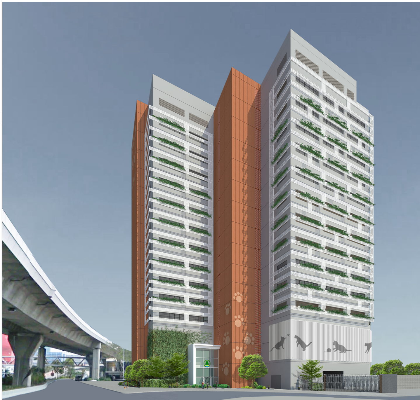
從西北面望向大樓的構思透視圖 PERSPECTIVE VIEW FROM NORTHWEST DIRECTION