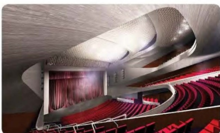
1450-seat Lyric Theatre (LT) 1450 個座位的演藝劇場