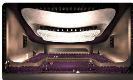
600-seat Medium Theatre (MT) 600 個座位的中型劇場