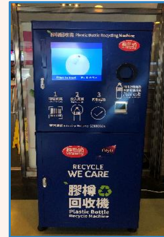
維他奶 – 膠樽回收機 Vitasoy – Plastic Bottle Recycle Machine