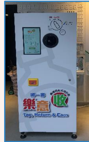
香港太古可口可樂有限公司 – 「啱一啱·樂意收」 Swire Coca-cola Hong Kong – “Tap, Return & Earn”

Existing plastic beverage containers recovery programmes launched by beverage suppliers: