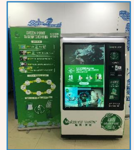
屈臣氏蒸餾水(香港) – 「分分有禮·滴滴賞」 Watsons Water (HK) – “Drops of Fun”