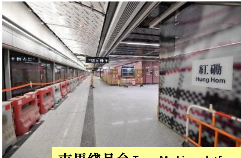
屯馬綫月台 Tuen Ma Line platform