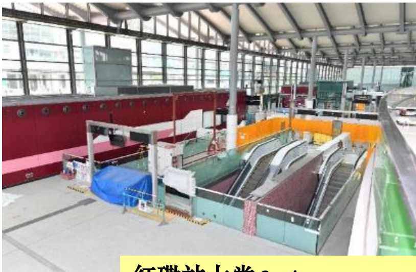
紅磡站大堂 Station concourse