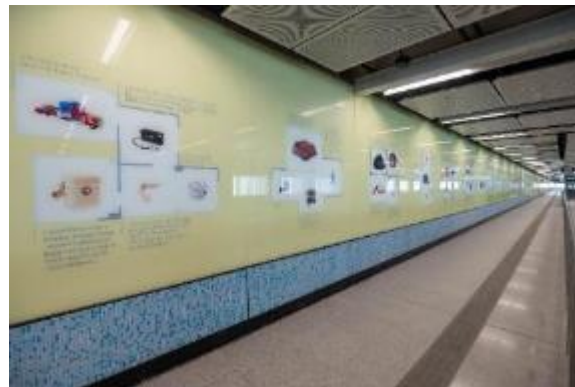
土瓜灣站 To Kwa Wan Station