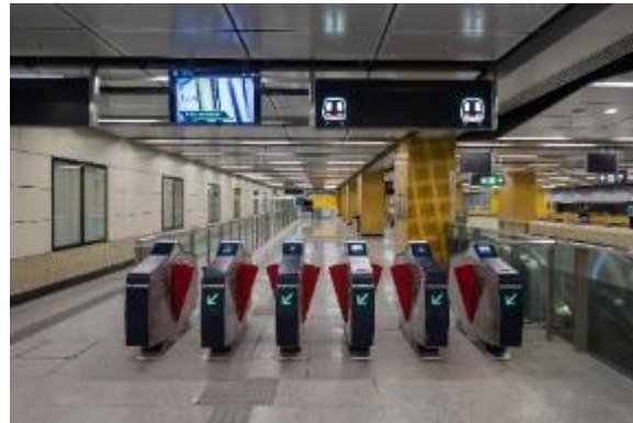
宋皇臺站 Sung Wong Toi Station