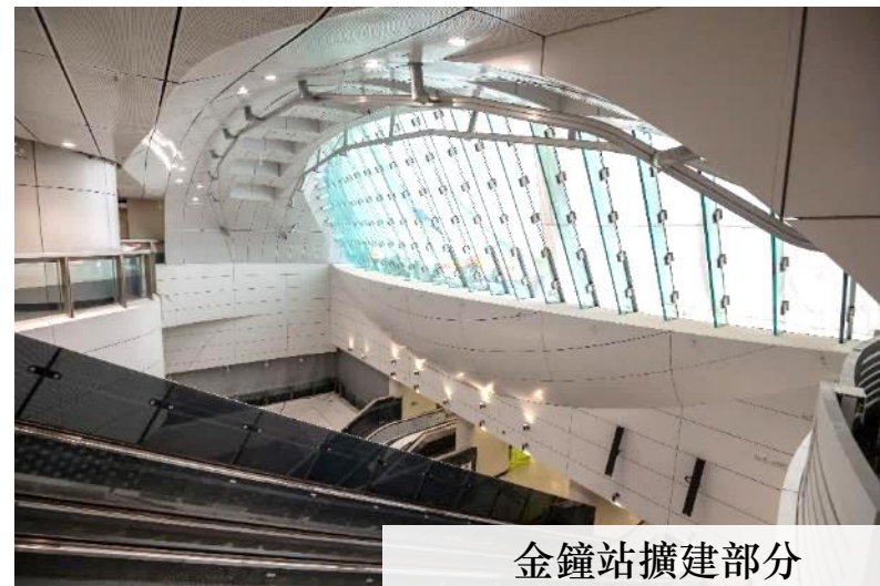
金鐘站擴建部分 Extended Admiralty Station