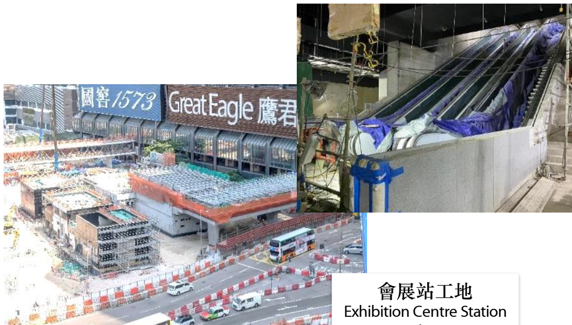
會展站工地 Exhibition Centre Station Works Site