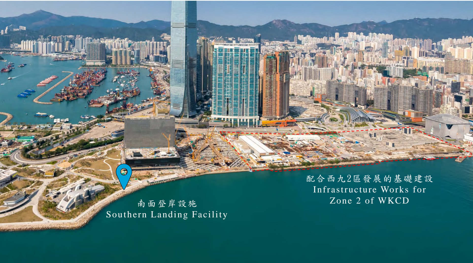
南面登岸設施 Southern Landing Facility

配合西九2區發展的基礎建設 Infrastructure Works for Zone 2 of WKCD