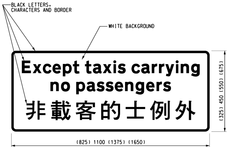
FIGURE No. 403A