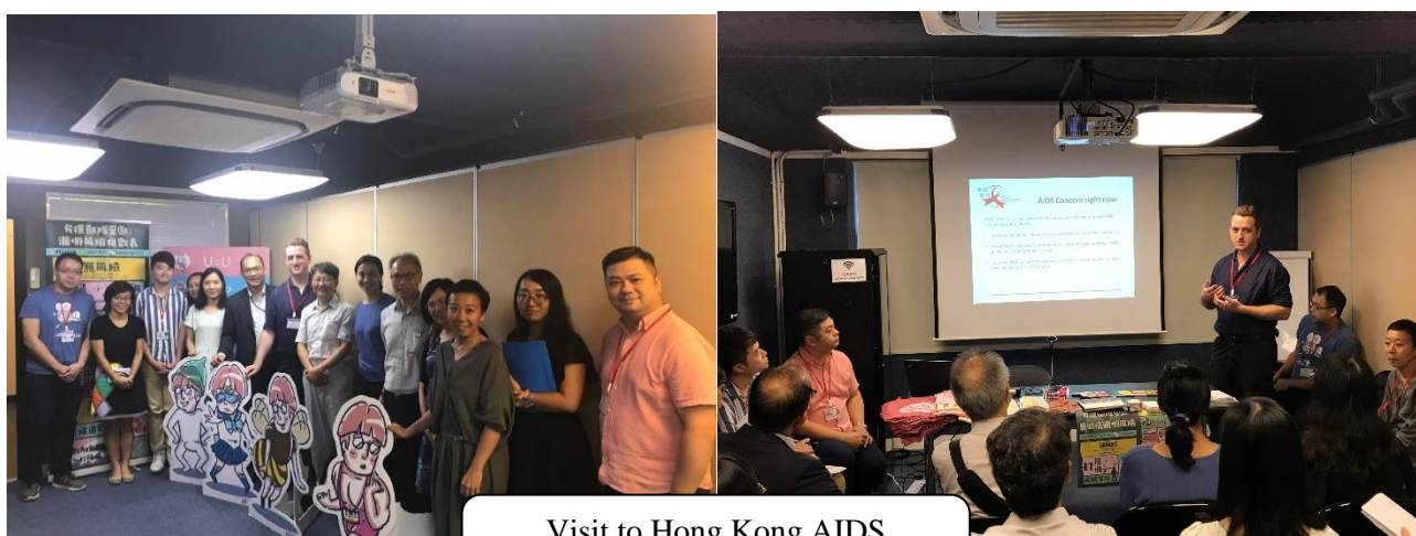
Visit to Hong Kong AIDS Concern Foundation Limited