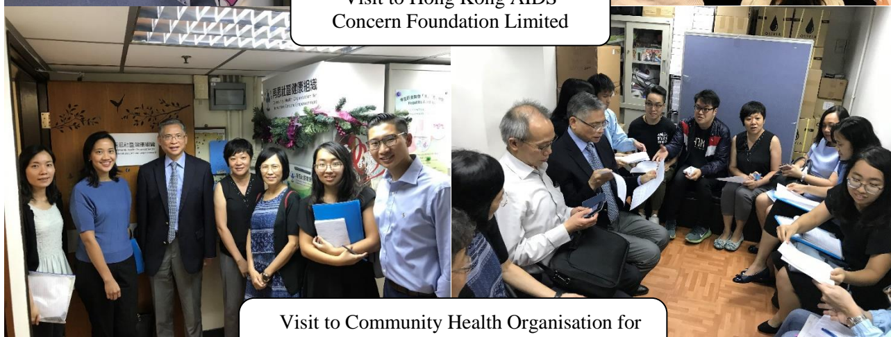
Visit to Community Health Organisation for Intervention, care and Empowerment Limited (CHOICE)