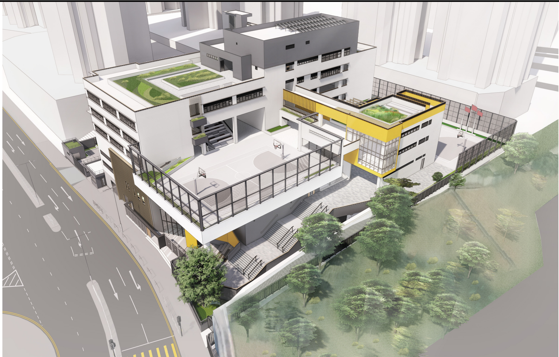
從南面望向小學的構思圖 PERSPECTIVE VIEW FROM SOUTHERN DIRECTION (ARTIST'S IMPRESSION)