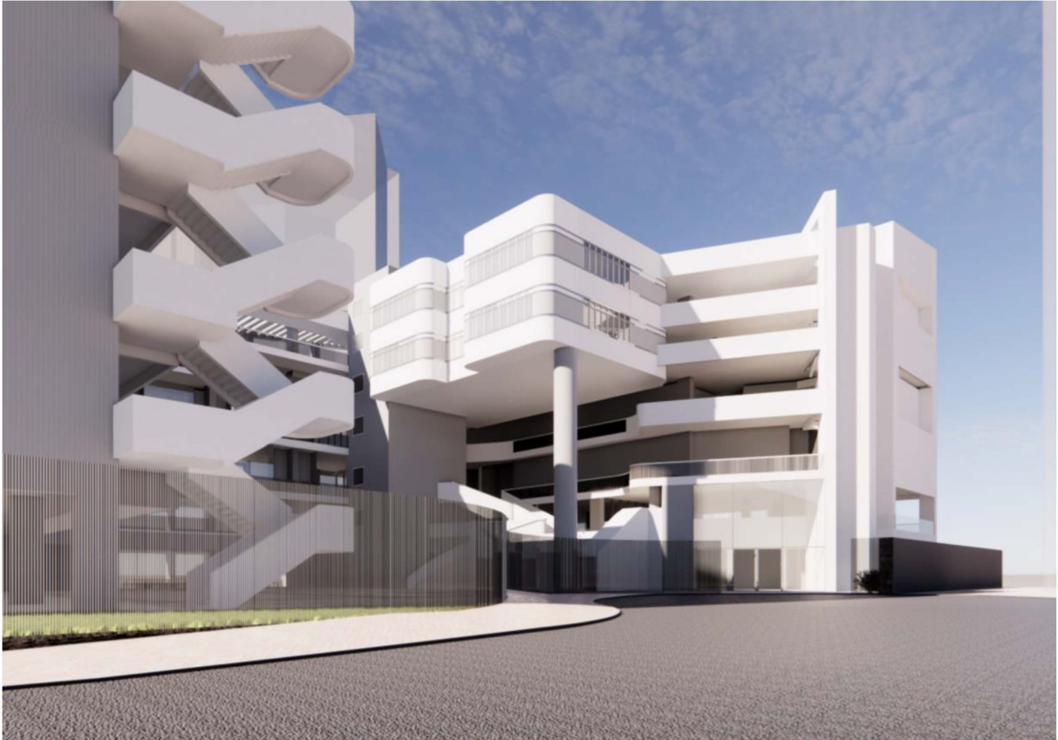
從東面望向中學的構思透視圖 PERSPECTIVE VIEW FROM EASTERN DIRECTION