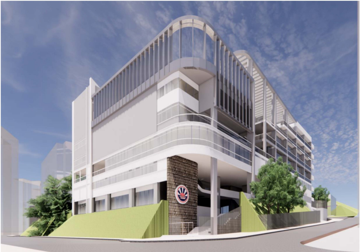
從西面望向中學的構思透視圖 PERSPECTIVE VIEW FROM WESTERN DIRECTION