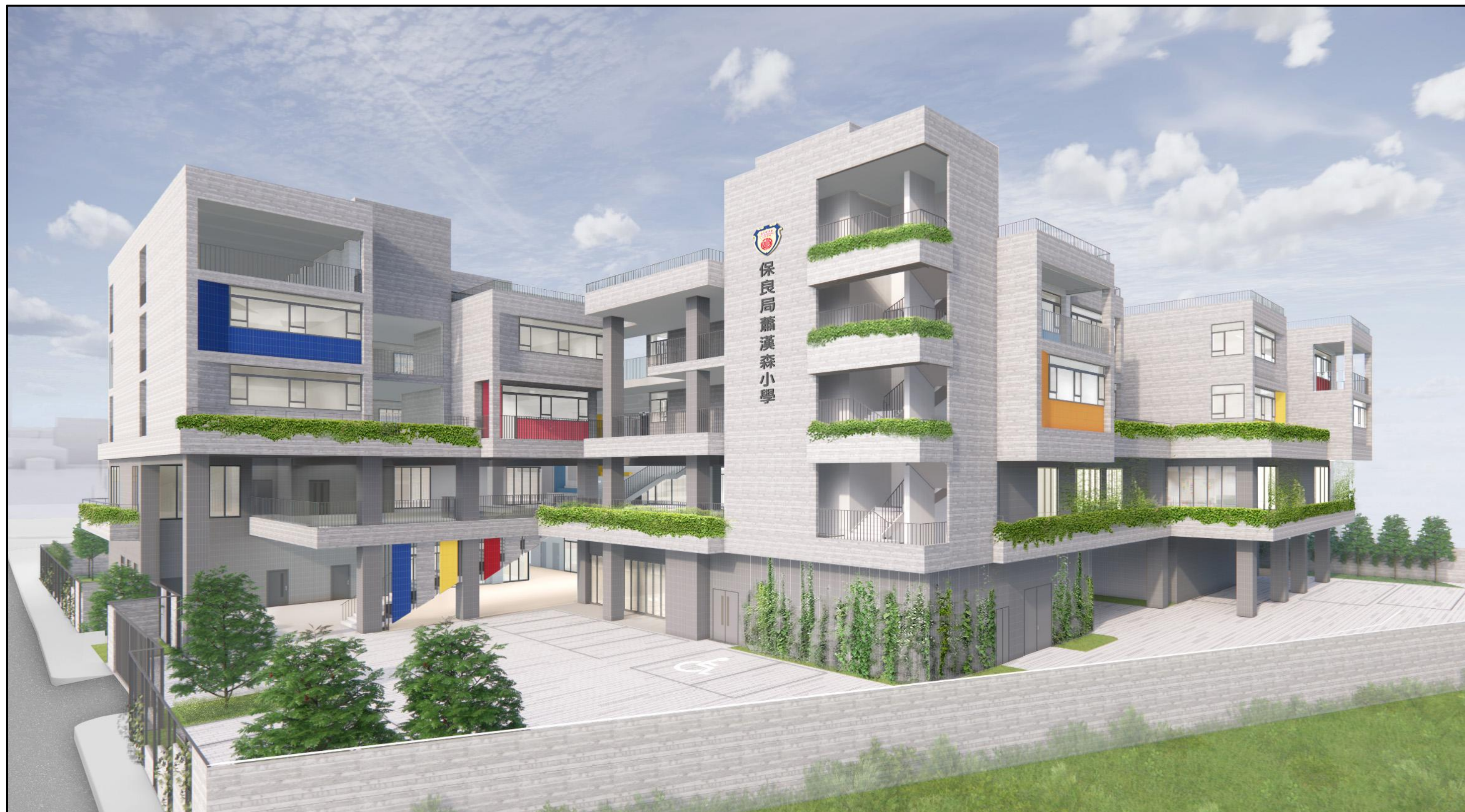
從北面望向小學構思透視圖 PERSPECTIVE VIEW FROM NORTHERN DIRECTION (ARTIST'S IMPRESSION)