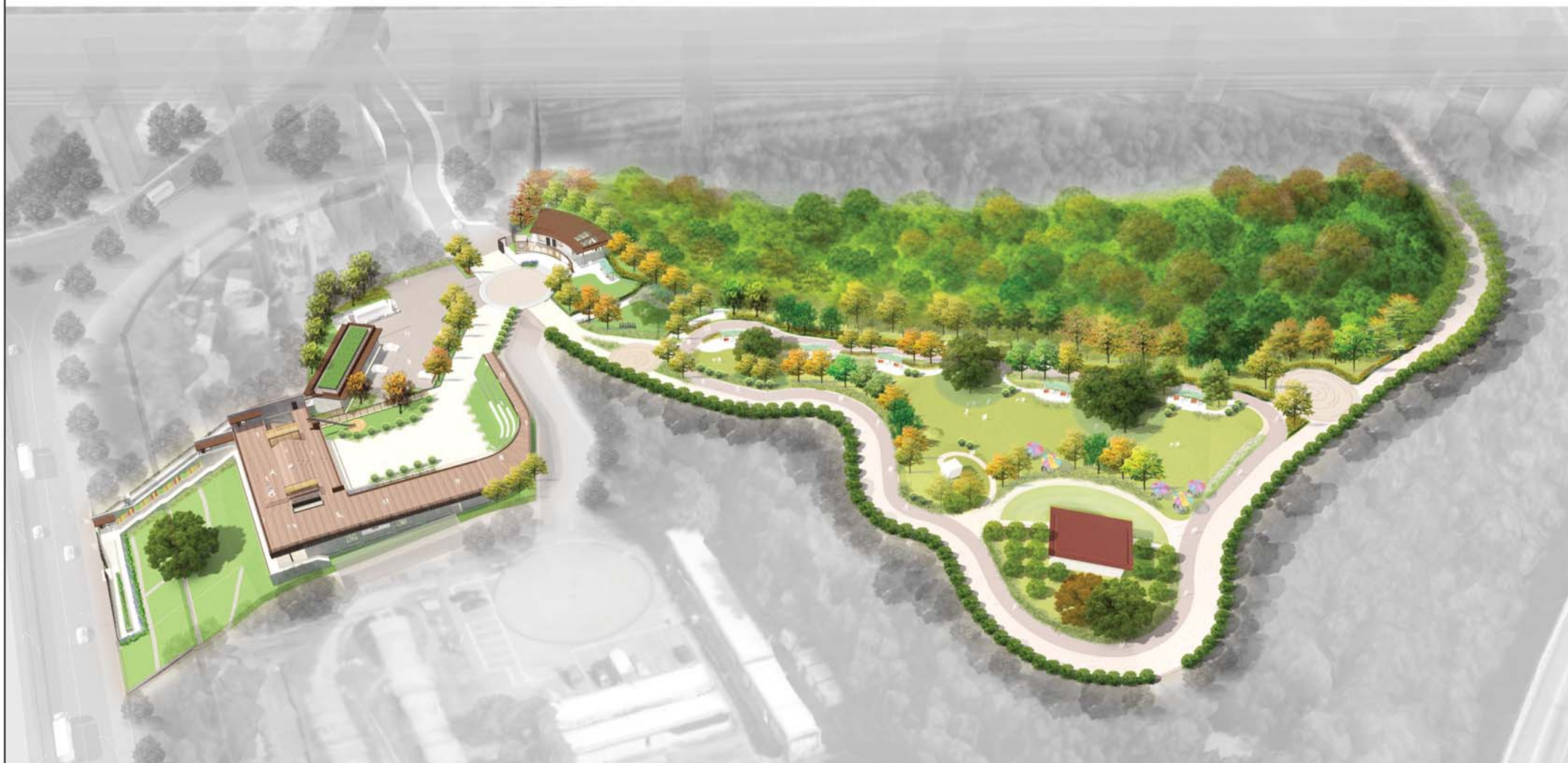
從南面望向葵涌公園的構思透視圖 PERSPECTIVE VIEW FROM SOUTHERN DIRECTION