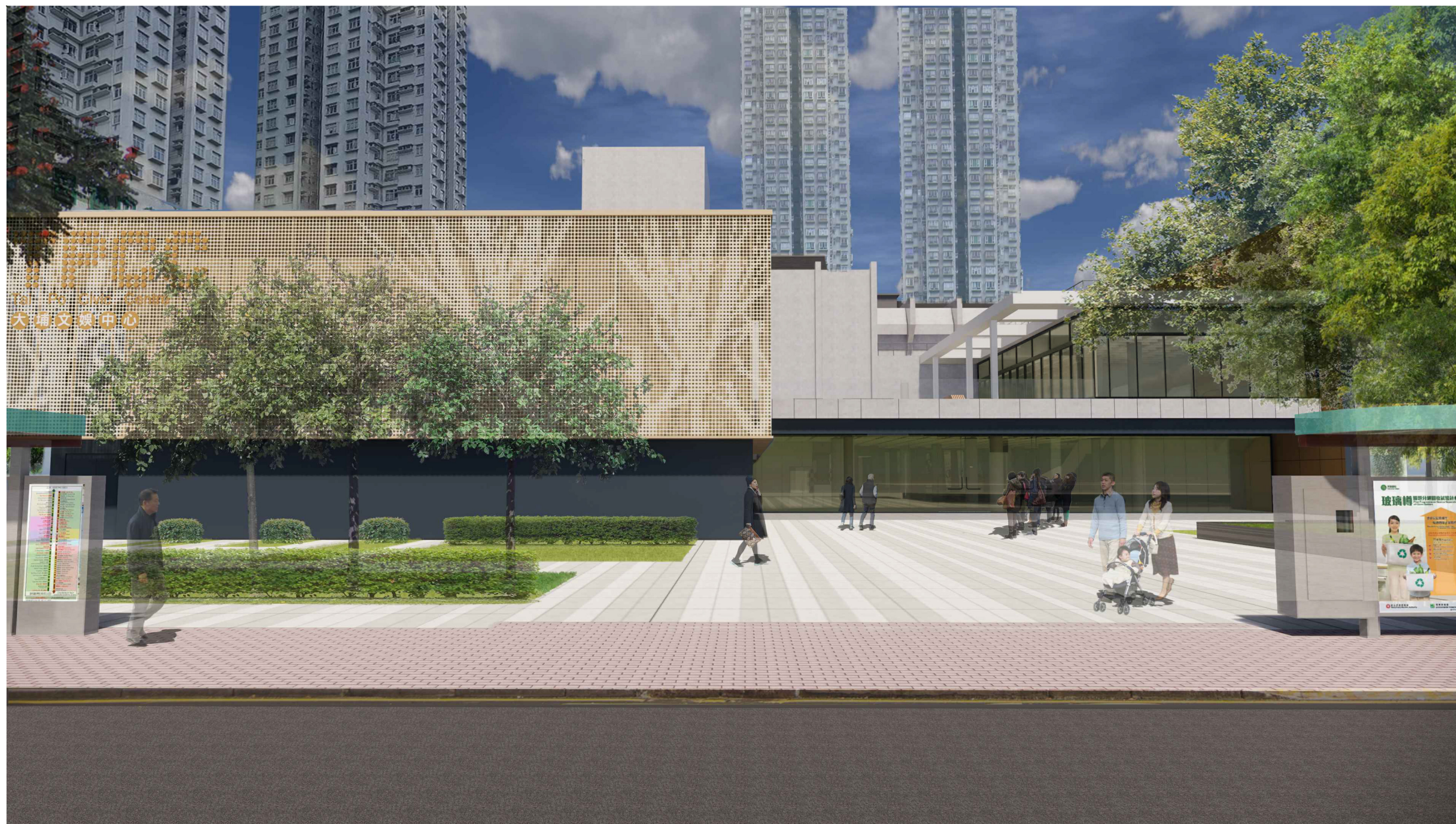
從安祥路望向大埔文娛中心的構思透視圖 PERSPECTIVE VIEW FROM ON CHEUNG ROAD (ARTIST'S IMPRESSION)