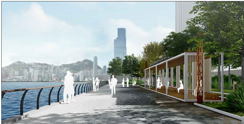
觀景點一的構思透視圖 PERSPECTIVE VIEW OF LOOKOUT POINT 1