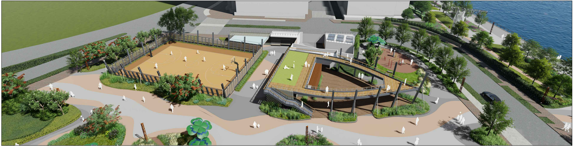
從西面望向擬議觀景台及籃球場的構思透視圖 PERSPECTIVE VIEW OF THE PROPOSED VIEWING DECK AND BASKETBALL COURT VIEWING FROM WEST DIRECTION (ARTIST'S IMPRESSION)