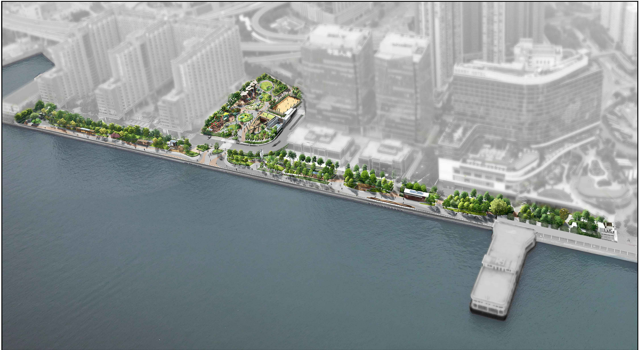
從東面望向休憩用地的構思透視圖 PERSPECTIVE VIEW FROM EASTERN DIRECTION (ARTIST'S IMPRESSION)