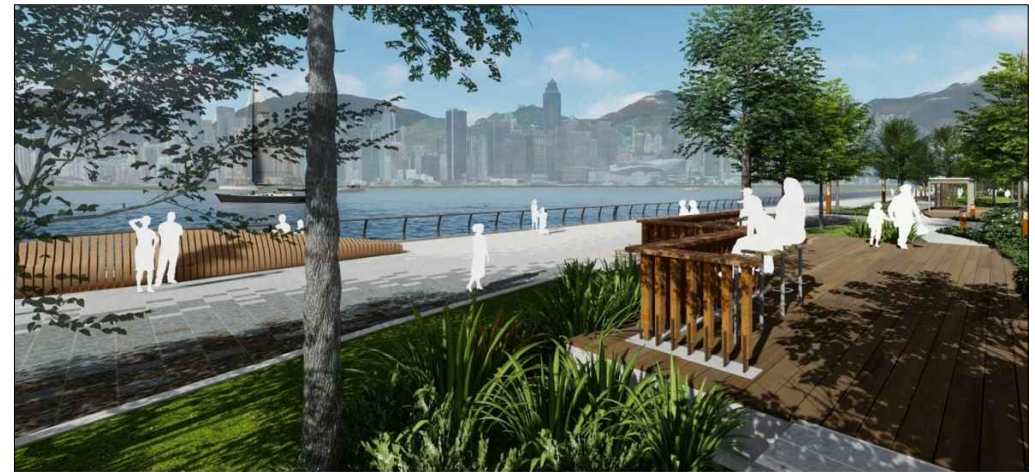
觀景點二的構思透視圖 PERSPECTIVE VIEW OF LOOKOUT POINT 2