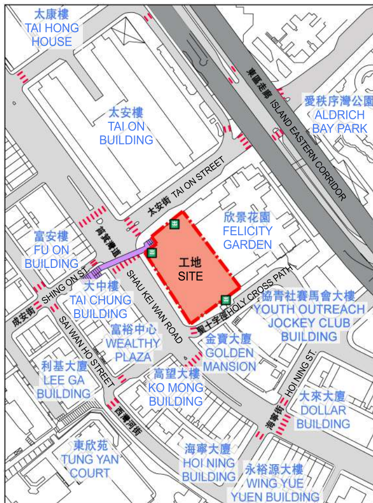
位置圖 LOCATION PLAN