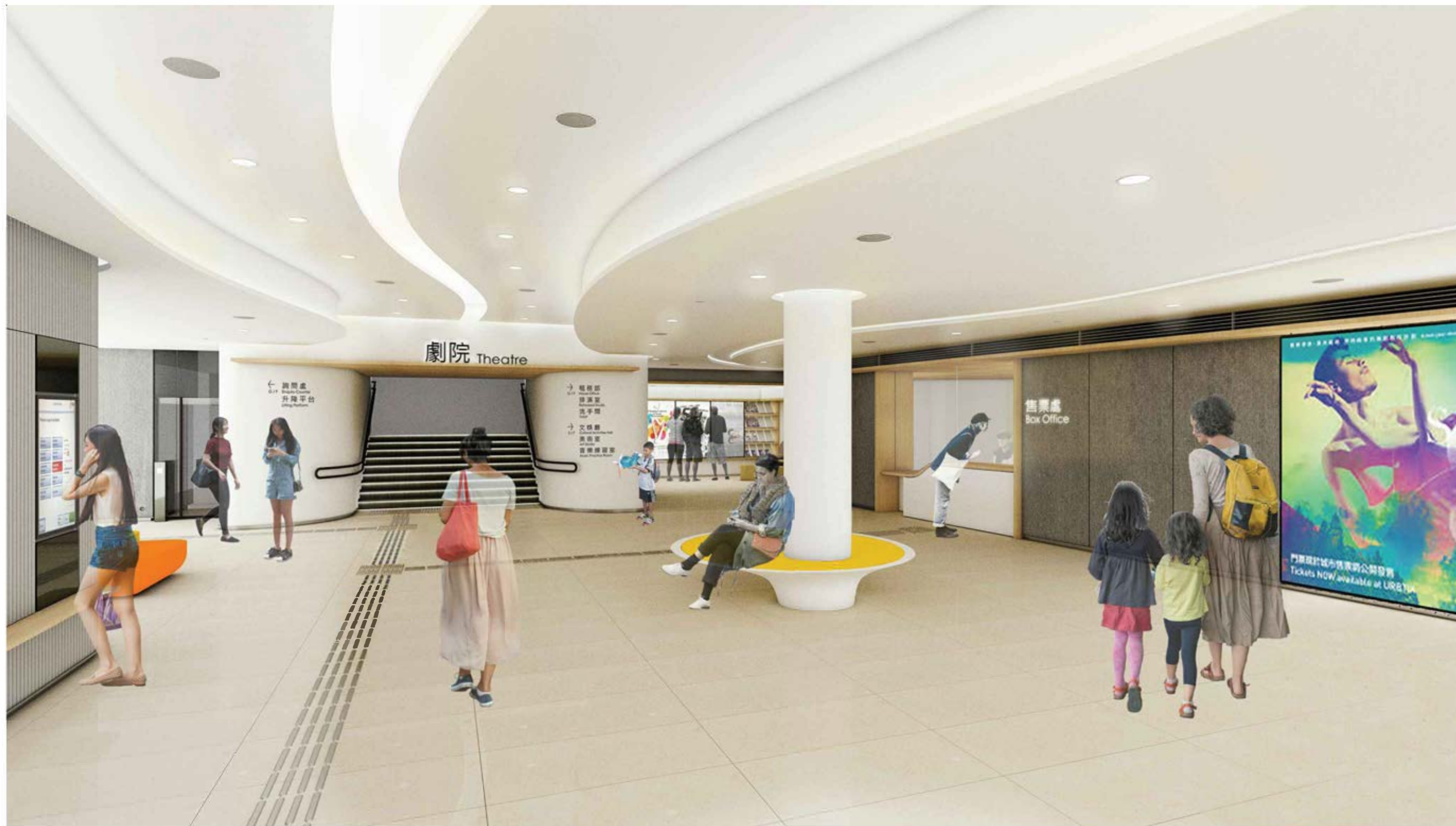
西灣河文娛中心大堂的構思透視圖 PERSPECTIVE VIEW FROM FOYER (ARTIST'S IMPRESSION)