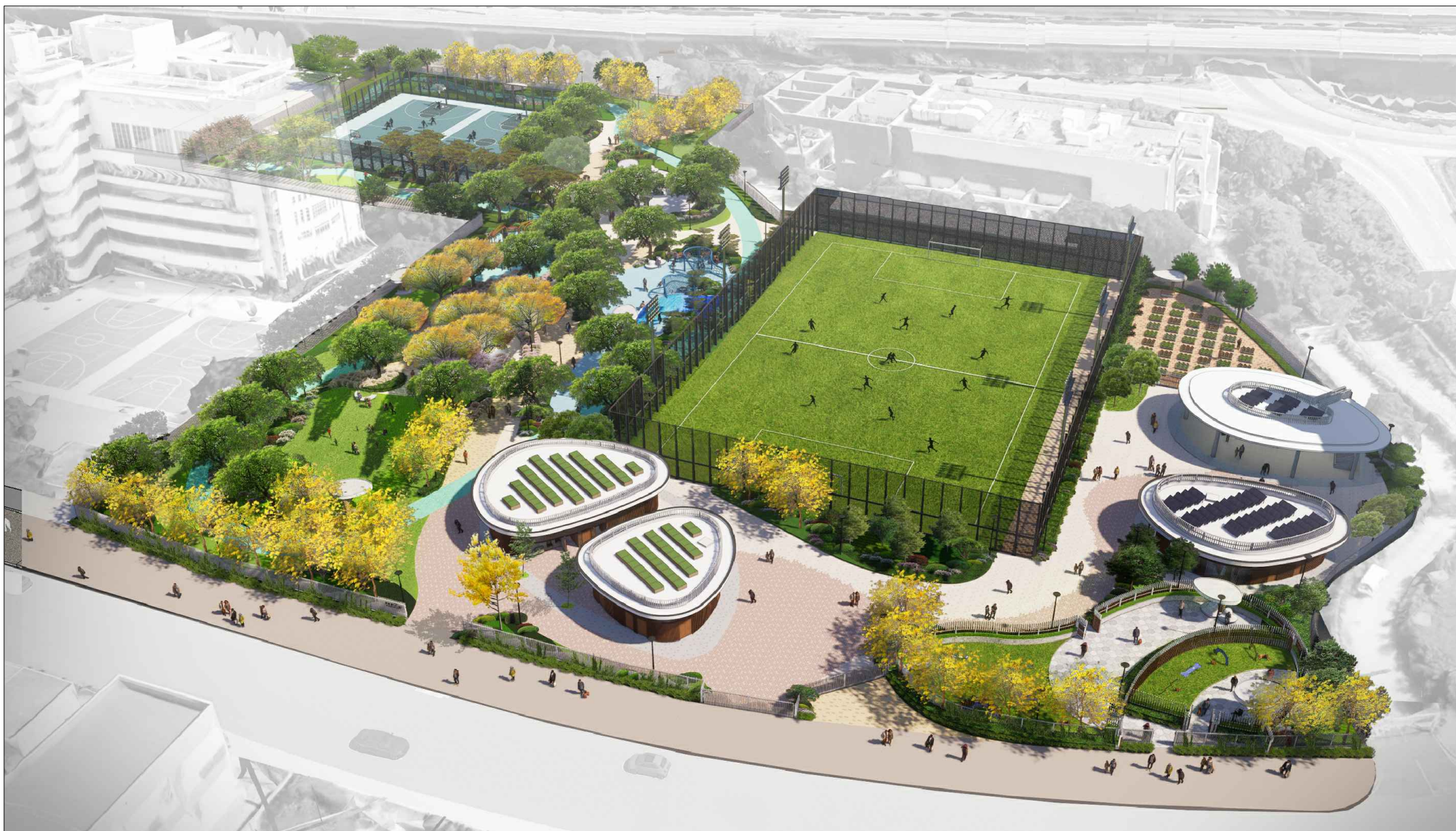
從西南面望向休憩用地的構思透視圖 PERSPECTIVE VIEW FROM SOUTHWEST DIRECTION (ARTIST'S IMPRESSION)