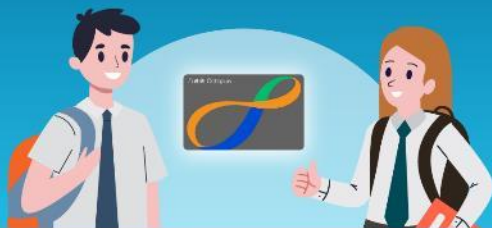
Student Travel Scheme