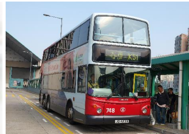
Free Interchange with MTR Buses

~40% passengers now enjoying the various discounts