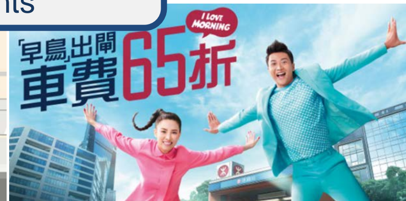
“Early Bird” Discount