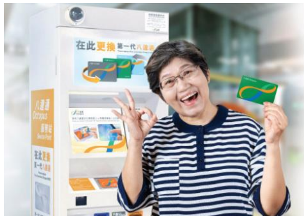
Fare Concession for Elderly