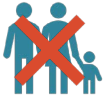
Social activities reduced