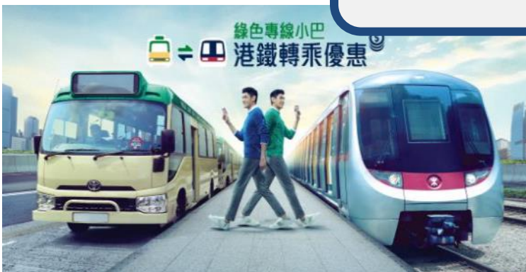
Interchange discount between MTR and Green-minibus

~40% passengers now enjoying the various discounts