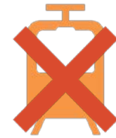
Suspension of High Speed Rail/ cross-boundary railway services