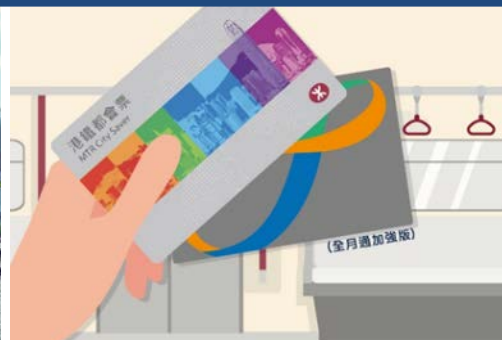
Monthly Pass Extras and City Saver