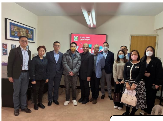
Visit to SWAN Academy Association Limited