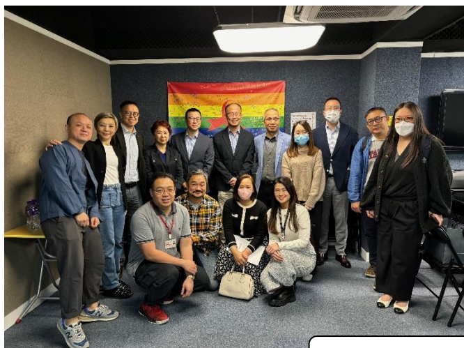
Visit to AIDS Concern