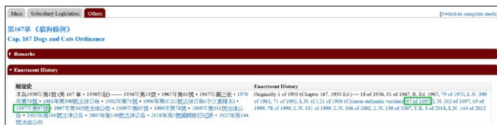
(Embedded hyperlinks in Enactment History)