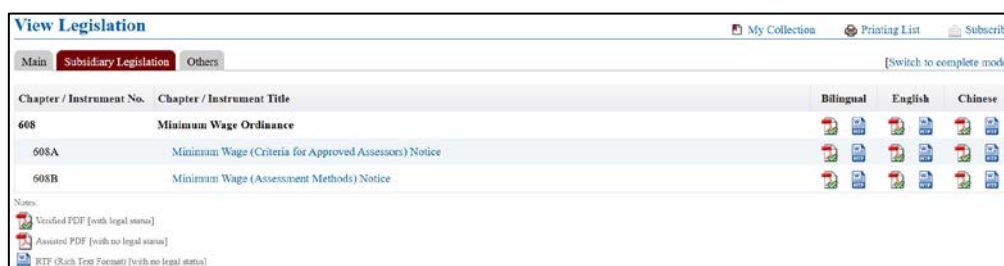
(“Subsidiary Legislation” tab)

18. In May 2021, to facilitate users to access all subsidiary legislation under a principal Ordinance, a “Subsidiary Legislation” tab (see illustration below) has been added to the “View Legislation” pages of the principal Ordinance and each item of subsidiary legislation. The tab shows the list of subsidiary legislation at a glance, and allows users to access an item of subsidiary legislation via embedded hyperlinks and download its PDF or RTF copy.